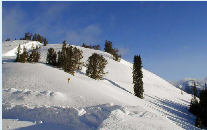
Mountain snowpack at Galena Summit, close to one of the long-term measuring sites shown in the map on the next page. April snowpack depth has decreased here and at another site in the valley below.

Diminishing snowpack may shorten the season for skiing and other forms of winter tourism and recreation. The tree line may shift, as subalpine fir and other high-altitude trees become able to grow at higher elevations. A higher tree line would decrease the extent of alpine tundra ecosystems, which could threaten some species.