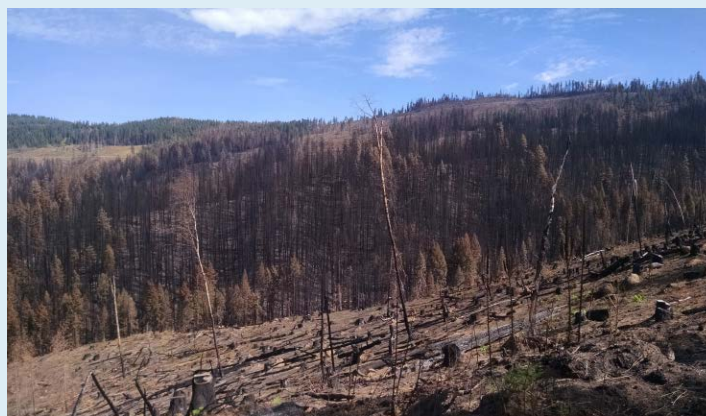
A few charred tree trunks are all that remains after a section of forest was burned by the Motorway Complex Fire near Syringa and Lowell in 2015.

The combination of more fires and drier conditions may expand deserts and otherwise change the landscape in southern Idaho. Many plants and animals living in arid lands are already near the limits of what they can tolerate. Higher temperatures and a drier climate would generally extend the geographic range of the Great Basin desert. In some cases, native vegetation may persist and delay or prevent expansion of the desert. In other cases, fires or livestock grazing may accelerate the conversion of grassland to desert in response to changing climate. For similar reasons, some forests may change to desert or grassland.