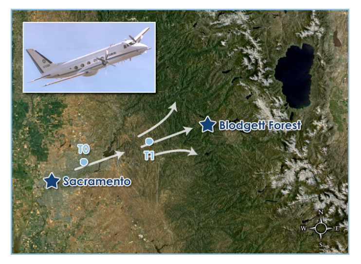
Measurements taken at two ground sites (T0 and T1) and from the G-1 aircraft will measure air as it flows northeast from Sacramento to the Blodgett Forest area.