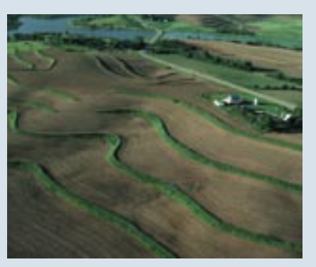
Figure 3. Contour terraces.