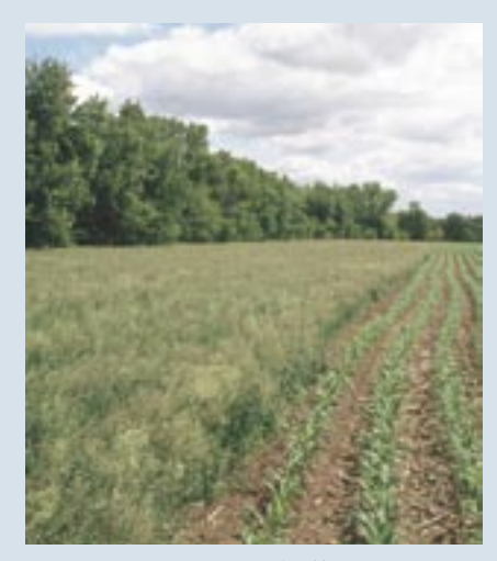
Figure 4. Conservation buffers.