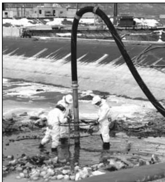
Pond sludge removal at Rocky Flats

While completing environmental cleanup activities at the Rocky Flats Environmental Technology Site, the Department must ensure that potential residual injuries to natural resources are identified and addressed in accordance with the Comprehensive Environmental Response, Compensation, and Liability Act through a process known as a Natural Resource Damage Assessment (NRDA). An OIG audit found that the Rocky Flats Project Office had not started the NRDA process. We found that in addition to the initiation of a NRDA process, integration of a Remedial Investigation/Feasibility Study would permit the Department to use the expertise of key personnel, with extensive knowledge of Rocky Flats and its natural resources contamination, before site closure. The Rocky Flats Project Office concurred with our recommendation and agreed to initiate the NRDA process at Rocky Flats. (OAS-M-06-02)