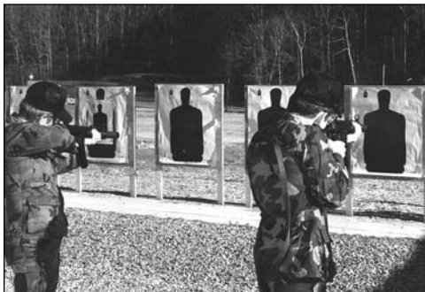
Rifle training at the Oak Ridge Reservation

An OIG inspection, initiated to determine whether the protective force contracts for the Oak Ridge Reservation had been modified to include incentives to reduce overtime, disclosed that the Oak Ridge protective force contracts did not include such incentives. Instead, the contract structure had the opposite effect on the overtime structure. We observed that the current protective force contracts at the Oak Ridge Reservation were due to expire and that the Department planned to