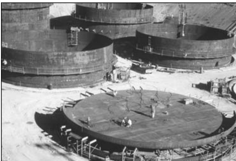
Waste storage tanks at the Hanford Site

OIG audit disclosed that, in terms of both schedule and cost, the Department will not meet its Agreement milestone for the retrieval of waste from the single-shell tanks located at the C-Farm. In addition, the Department estimated that waste retrieval costs have increased to $215 million, more than doubling the initial estimate. In our judgment, the Department