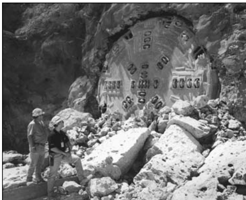
Tunnel-boring machine breaks daylight at Yucca Mountain

repository requires that the Department publicly disclose all documents, including e-mails, relevant to the process. An OIG inspection found that OCRWM's process for reviewing approximately 10 million archived e-mails for NRC process relevance did not fully ensure that quality assurance issues were promptly identified, investigated, reported, and resolved in accordance with Administrative Procedure 16.1 Q. Specifically, we found e-mails that identified possible conditions adverse to quality at Yucca Mountain that had not been identified by Yucca Mountain personnel as requiring further review for quality assurance