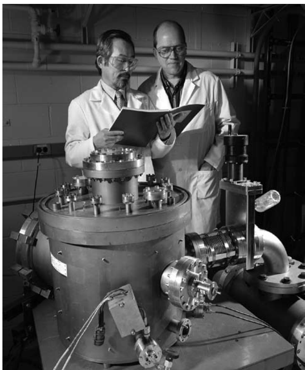
Nanofluid developers at the Argonne National Laboratory.

establishing safety policies to protect workers. We initiated an audit to determine whether the Department's laboratories were employing appropriate safety measures specifically tailored for working with nanoscale materials based on the standards established by the Centers for Disease Control and the National Institute of Occupational Safety and Health (CDC/NIOSH). We found that the Department and its laboratory contractors had not always complied with precautionary measures outlined by the CDC/NIOSH. In addition, the Department had not established a mechanism to disseminate nanoscale materials safety information. (DOE/IG-0788)