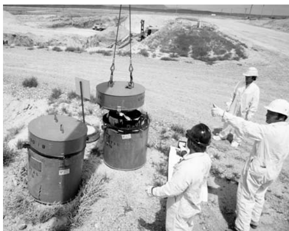
Waste Receiving and Processing at Hanford Site.

An audit was initiated to determine whether the Department was maintaining publicly accessible websites that were secure and managed in accordance with Federal requirements. Our audit revealed a number of weaknesses in the Department's security of its websites. Management agreed with our recommended improvements over these publicly accessible websites. (DOE/IG-0789)