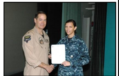
AT2 Stone - LOA