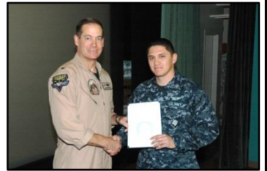
AO1 Lomeli - LOC