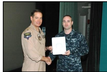
AO1 Ward - LOC