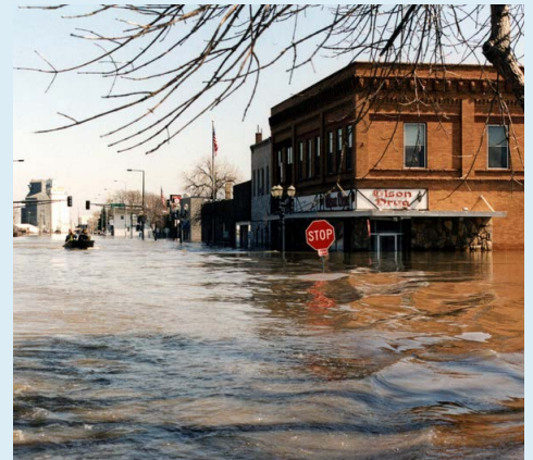
Flooding of the Red River in East Grand Forks in 1997.

Higher temperatures and heavier storms could harm water quality in Minnesota's lakes and rivers. Warmer water tends to cause more algal blooms, which can be unsightly, harm fish, and degrade water quality. Severe storms increase the amount of pollutants that run off from land to water, so the risk of algal blooms will be greater if storms become more severe. Increasingly severe storms could also cause sewers to overflow into lakes or rivers more often, threatening beach safety and drinking water supplies.