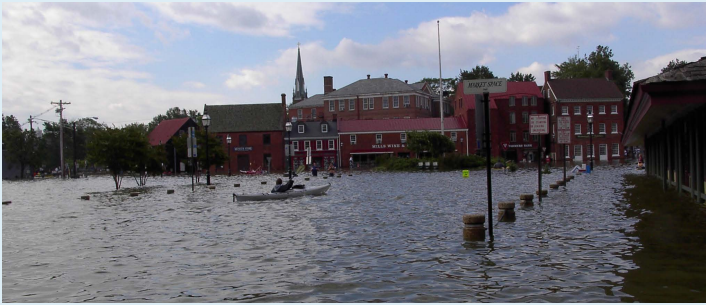
Downtown Annapolis the day after Hurricane Isabel struck the Atlantic coast on September 18, 2003.

Although hurricanes are rare, their wind speeds and rainfall rates are likely to increase as the climate continues to warm. Rising sea level is likely to increase flood insurance rates, while more frequent storms could increase the deductible for wind damage in homeowner insurance policies.