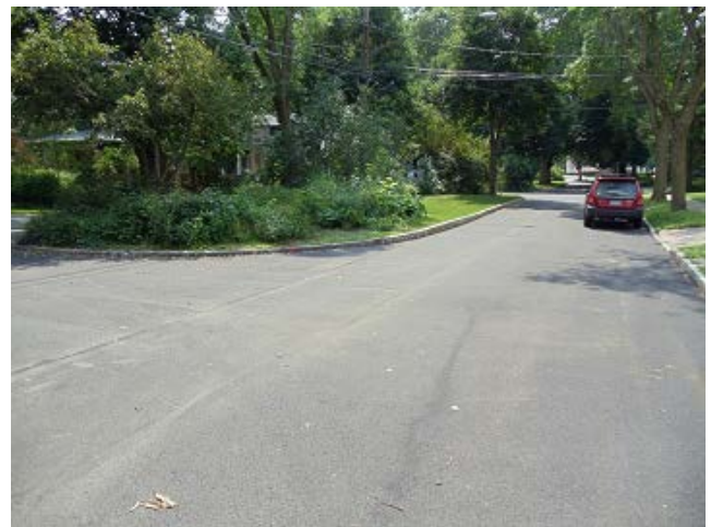
Concord Place (looking at center island)