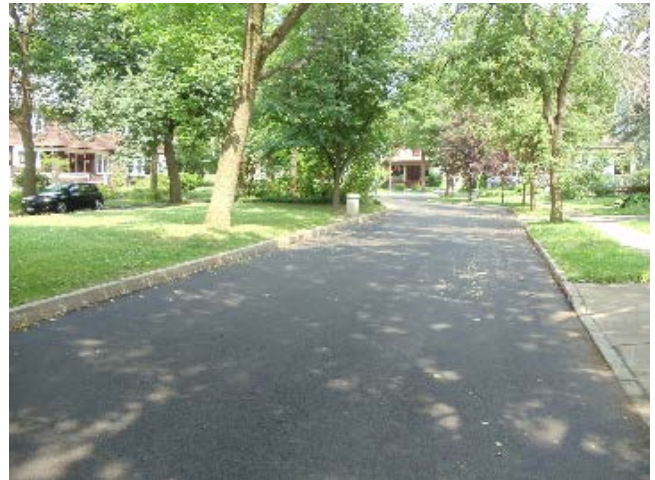
Concord Place (looking south)