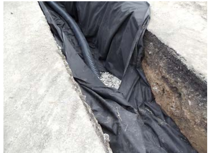
Construction of the underground infiltration trench at Concord Place