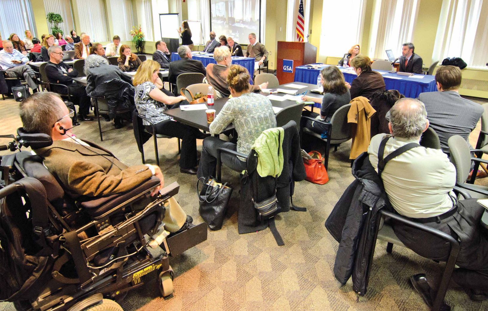
FEMA employees and partners from Federal, state, public, and community-based organizations attend a meeting in New York on the inclusion of persons with disabilities and others with access and functional needs.

To effectively fulfill its emergency management mission, FEMA must be flexible and adaptable. Hazards and threats evolve, major events regularly disrupt routine business, and new requirements emerge on an ongoing basis. Recognizing that the foundation of the Agency is its people, FEMA's workforce must be strong and agile. The Agency's business practices must also be dynamic and robust enough to meet continuous challenges. The objectives below will further this goal by strengthening the workforce, investing in data-driven decision-making, streamlining business processes, and better aligning operations with strategic priorities. Achieving excellence in these areas will result in unity of effort across FEMA and will better position the Agency for success across all strategic priorities.