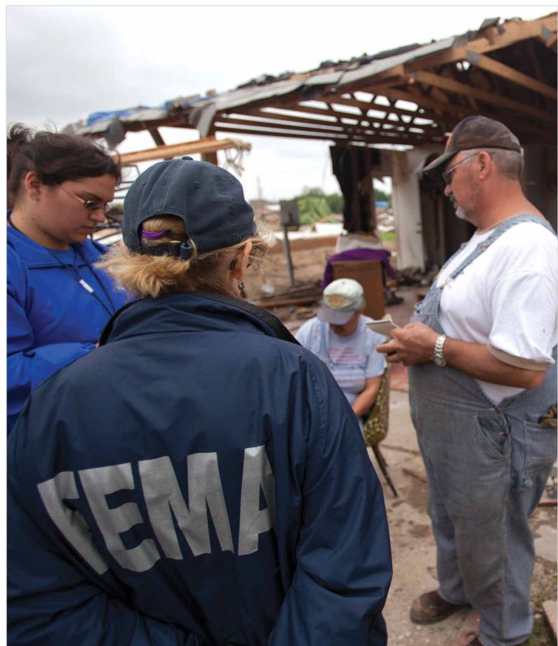
FEMA employees register survivors for disaster assistance in Moore, Oklahoma.

In addition to the assistance provided through a wide range of FEMA programs, many survivor services are also provided by other organizations including public-, private-, and nonprofit-sector programs. FEMA plays an important role in working with whole community partners to help ensure that survivors can access applicable services as efficiently and effectively as possible.