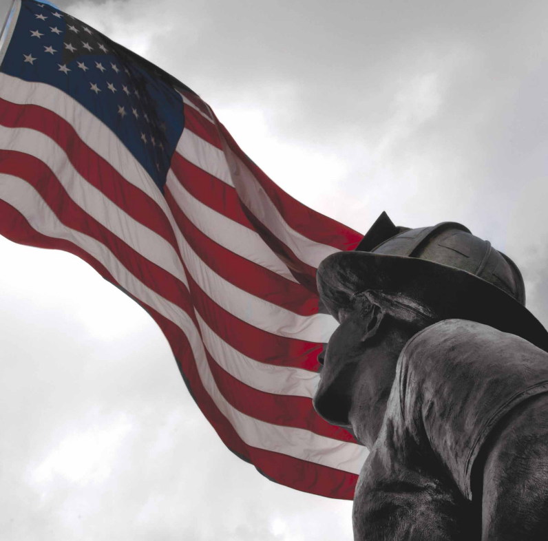
A statue dedicated to the firefighters who lost their lives in New York City on September 11, 2001, located at the National Emergency Training Center in Emmitsburg, Maryland.