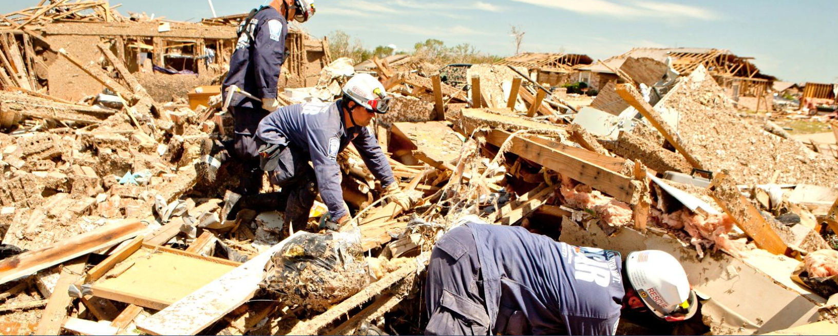
FEMA Urban Search and Rescue team members search house to house for survivors in a tornado-devastated neighborhood in Moore, Oklahoma.

The greatest challenge in emergency management lies in preparing for a catastrophic disaster—an event with impacts so severe that existing emergency plans, coordination structures, and communications are insufficient and governmental capacity at all levels is quickly depleted. In its worst form, a disaster like this would be unprecedented in scale and complexity, and offer no advance notice of its arrival. For planning purposes, it is useful to focus on events that could exceed our current capabilities, because creative efforts to address worst-case scenarios can also help build the Nation’s resilience to disasters of all types.