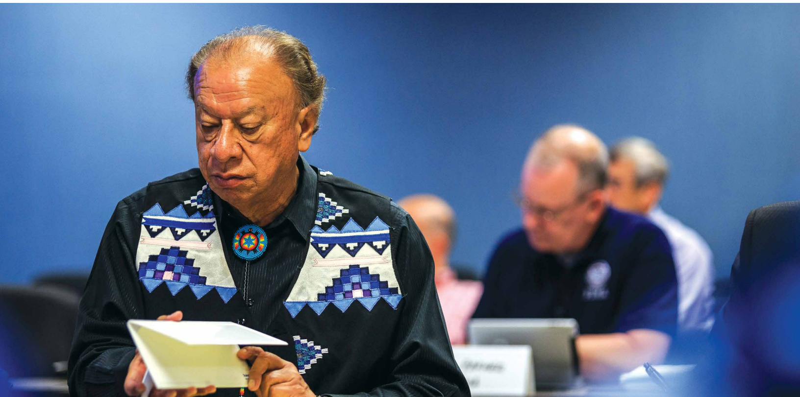
Tribal leaders from Nebraska, Kansas, Iowa, and Missouri meet in Kansas City to help better prepare for potential disasters in the future.

Increase the National Preparedness Report score for recovery and mitigation core capabilities by 3 to 5 percentage points each year.