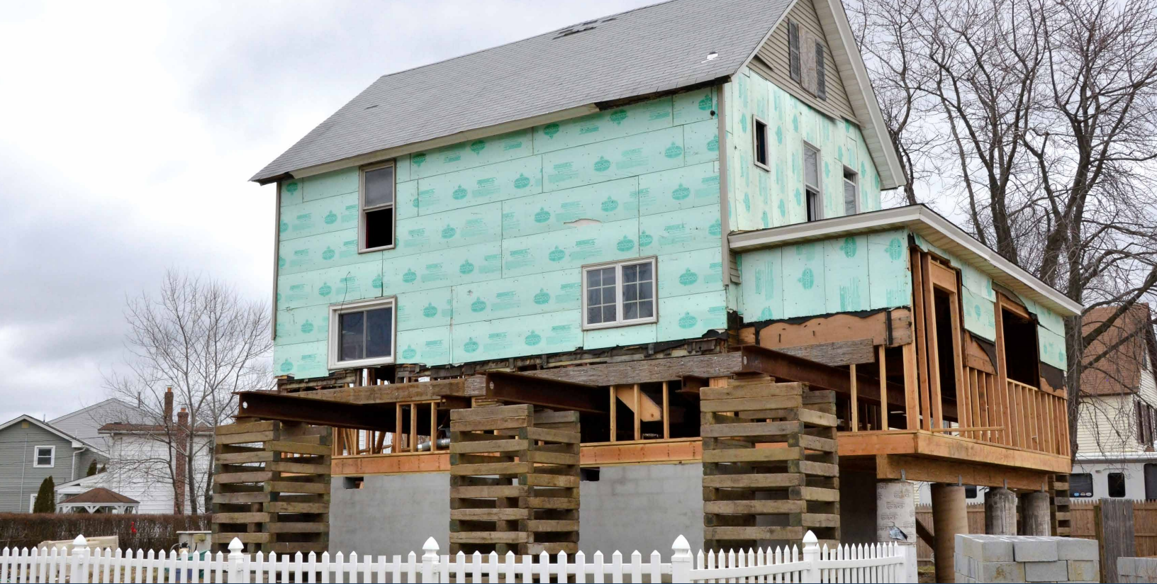
New framing is in place on a home that is being elevated in Union Beach, New Jersey after having been damaged by Hurricane Sandy.