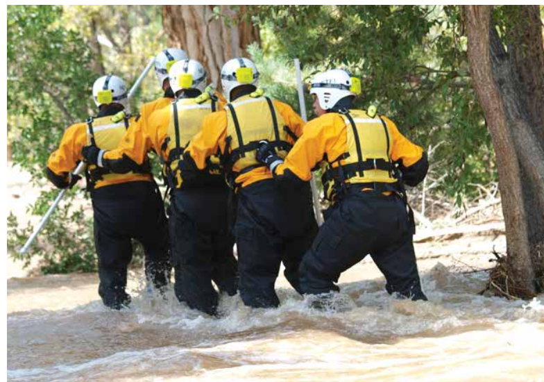
An Urban Search and Rescue team near Boulder, Colorado.

Increase the operational readiness and deployability rating of FEMA's workforce to 80 percent or greater by the end of 2018.