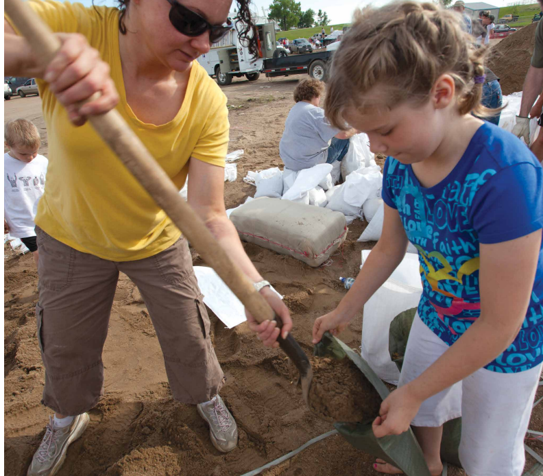
Thousands of residents work tirelessly sandbagging along the Souris River in Minot, North Dakota.

By the end of 2018, increase jurisdictions reported by states to have typed and inventoried their response and recovery resources and assets consistent with the National Incident Management System by 16 percentage points.