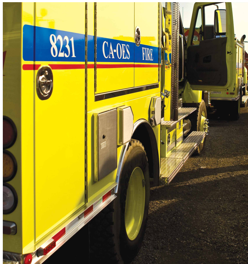
This state wildland fire-fighting apparatus is staged to be used to fight wildland fires in Southern California.

A catastrophic disaster will require FEMA to facilitate the rapid expansion of response and recovery capabilities in new ways. To better prepare for such an event, FEMA will strengthen resource sharing with key partners who have the ability to contribute to catastrophic disaster response efforts. FEMA