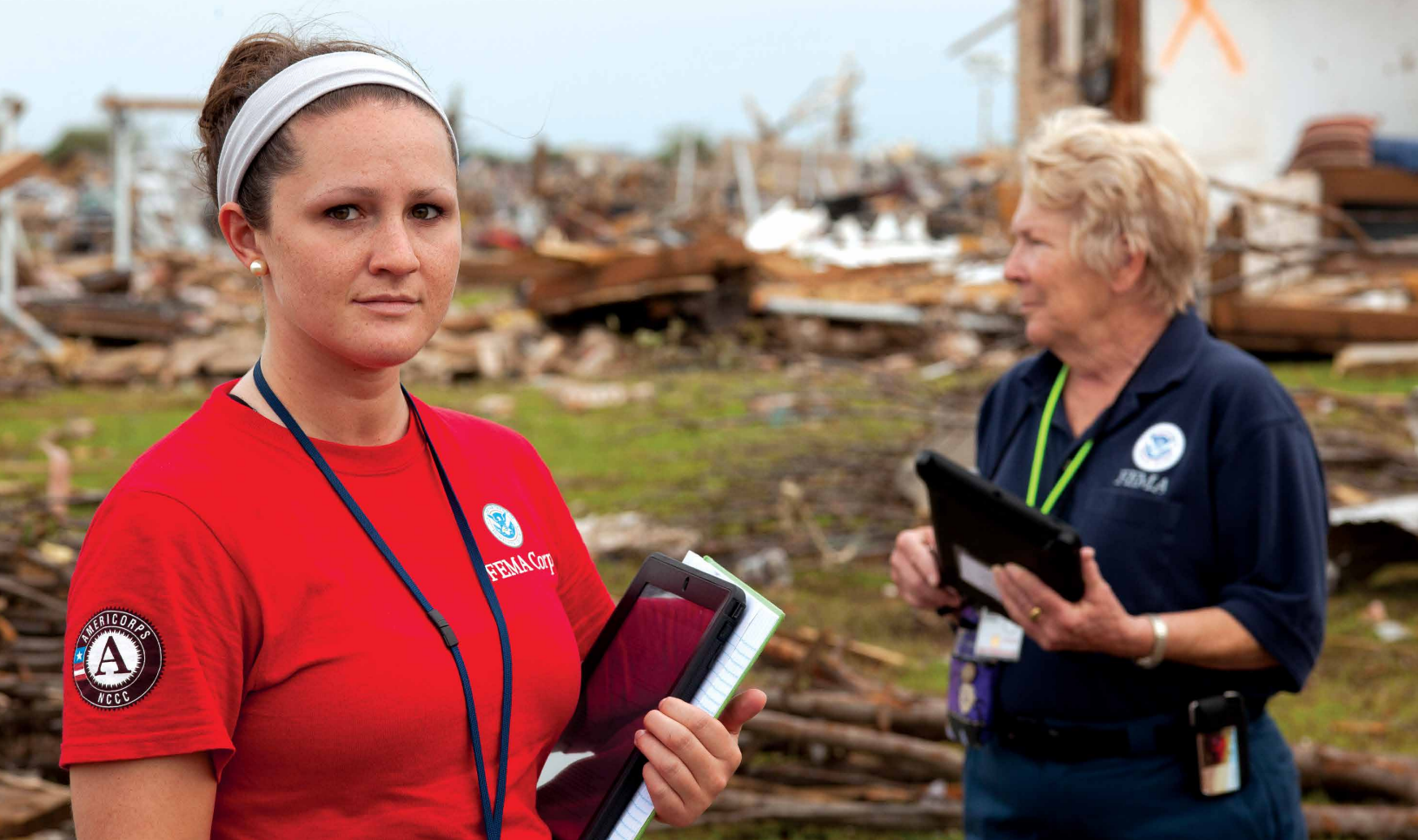
FEMA canvasses tornado-stricken neighborhoods in Moore, Oklahoma.