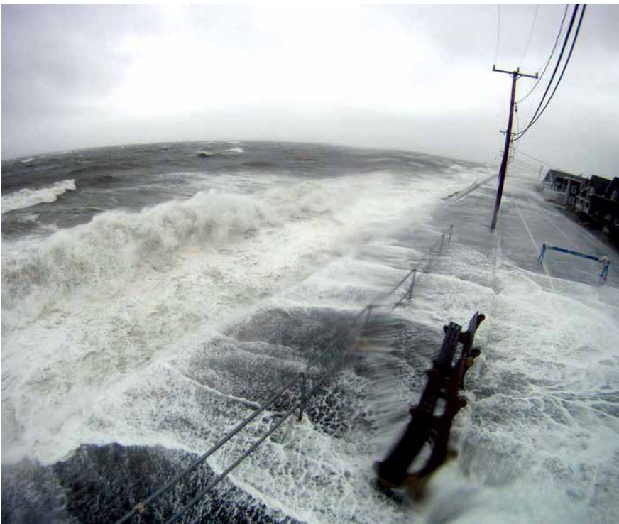
Hurricane Sandy pounds the Massachusetts coast, cresting over Seaview Avenue in Oak Bluffs.

By the end of 2018, increase the overall cost benefit ratio of the National Flood Insurance Program by 5 percentage points.