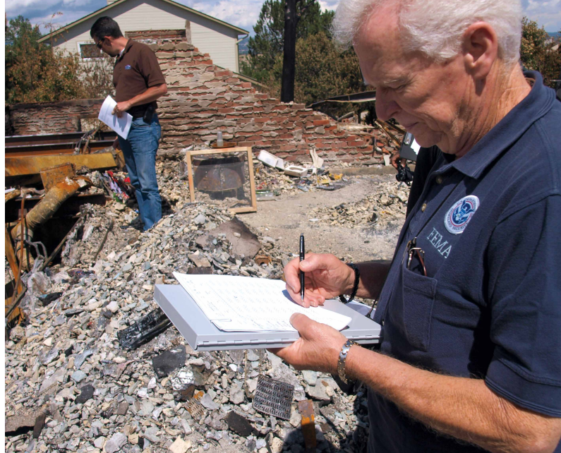
Assessing damage from the Waldo Canyon fire in Colorado.

tools including Hazus,* the Nation’s flood maps, and the THIRA process for better integration and understanding across the whole community.