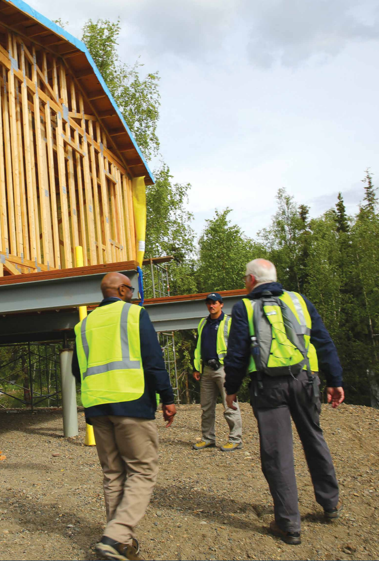
Inspecting the construction of Cold Climate Housing in Galena, Alaska.

flood insurance, flood hazard mapping, grants, and management of floodplains. Many of the changes are designed to strengthen the fiscal soundness of the NFIP by ensuring that flood insurance rates accurately reflect the real risk of flooding. FEMA will continue working with Congress, private insurance companies, and other stakeholders to implement these reforms. In addition to required reforms, the NFIP will continue to identify and embrace policies that