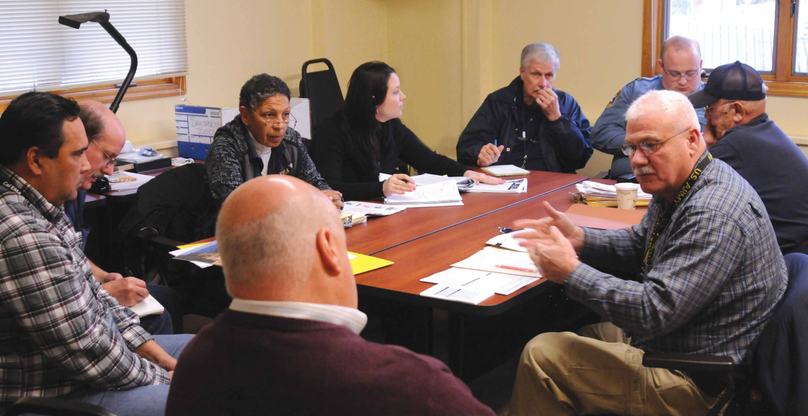
State and local officials attend a meeting in Kearny, New Jersey, to discuss FEMA's Public Assistance Program in the wake of Hurricane Sandy.

FEMA will pursue the following strategies to streamline and simplify disaster services for individuals and communities: