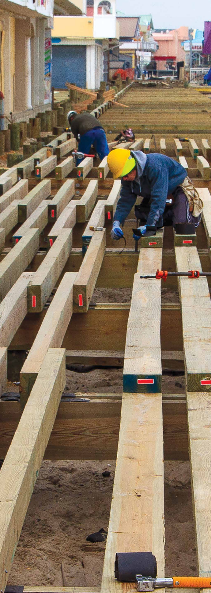
Construction underway to rebuild a boardwalk destroyed by Hurricane Sandy in Point Pleasant, New Jersey.