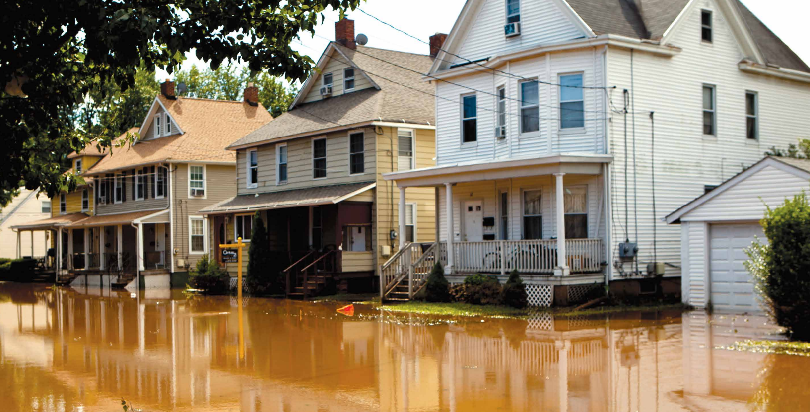
Flooded homes and closed roads in Bound Brook, New Jersey, after Hurricane Irene.

The Nation faces increasing disaster risk in the near and long term due to multiple interacting factors such as shifting demographics, aging infrastructure, and climate change. One of the most significant contributors to changing risk levels is the increased concentration of populations in and around high-risk areas. Reducing loss of life, injuries, and disaster costs will require concerted, risk-informed action by individuals, businesses, and communities, as well as a range of state, tribal, territorial, and Federal government agencies.