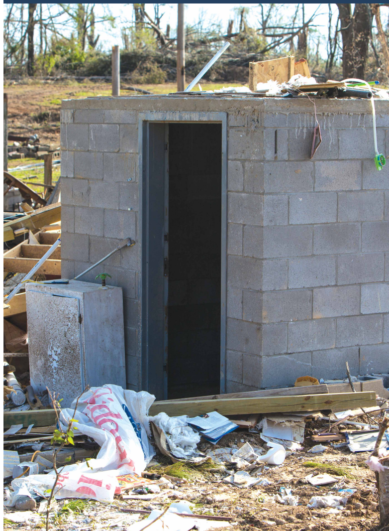
A safe room still stands among tornado debris in Mayflower, Arkansas.

The National Flood Insurance Program (NFIP) serves as a keystone for national efforts to reduce the loss of life and property from flood disasters. The program is designed to insure against, as well as mitigate, the long-term risks to people and property from the effects of flooding, and to reduce the escalating