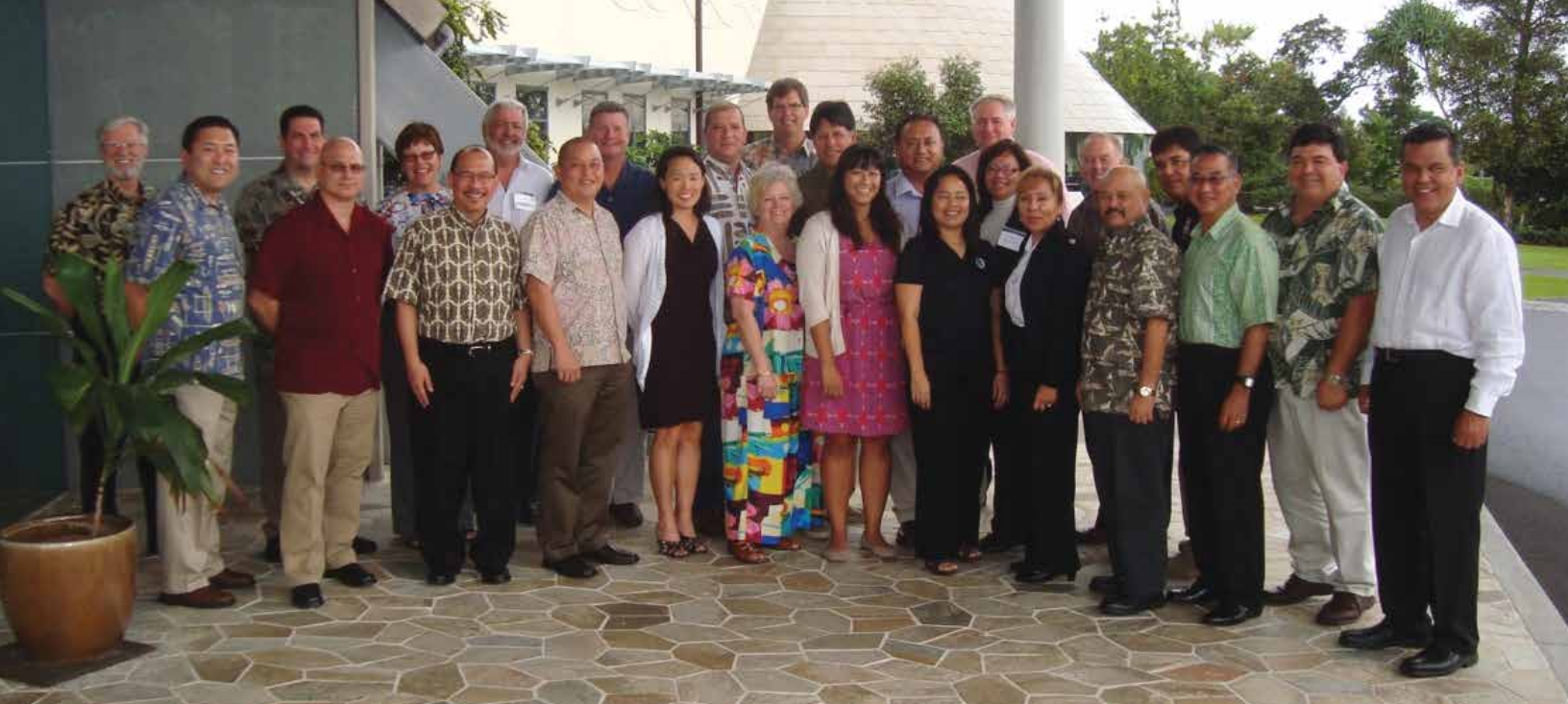
Graduates from the 2013 Pacific Executive Leaders Program in Hilo, Hawaii.

To drive action and achieve results, this Strategic Plan must inspire, guide, and cascade to the work efforts and activities at all levels of the Agency. Leadership, program managers, and individual employees need to understand how FEMA's strategic direction informs their work and actively align resources, manage performance, and evaluate outcomes to advance this strategy.