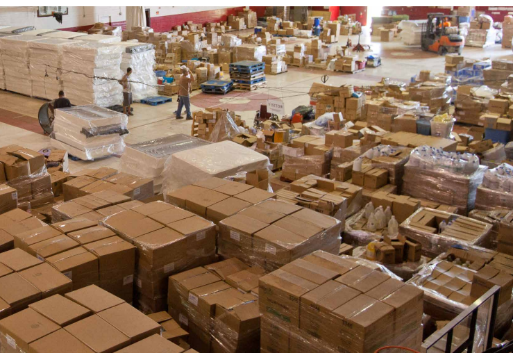
Disaster supplies at the Journey Disaster Relief Center in Norman, Oklahoma.

Increase the number of survivors reporting that they received information, education, or training (from FEMA or another source) that led them to take action in the immediate aftermath of a disaster by 8 percentage points by the end of 2018.