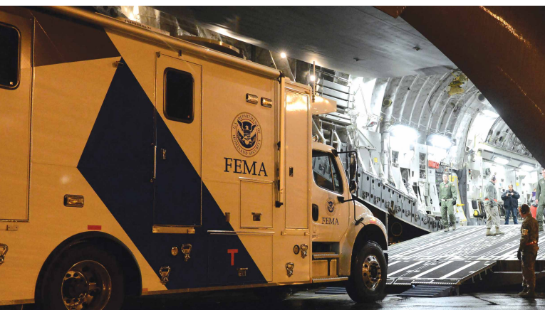
FEMA mobile emergency operations vehicle loading onto a C-17 cargo aircraft for mobilization to Alaska during a Capstone Exercise.

By the end of 2018, deliver 95 percent of orders for required life-sustaining commodities (e.g., meals, water, tarps, plastic sheeting, cots, blankets, and generators) and key initial response resources by the targeted date.