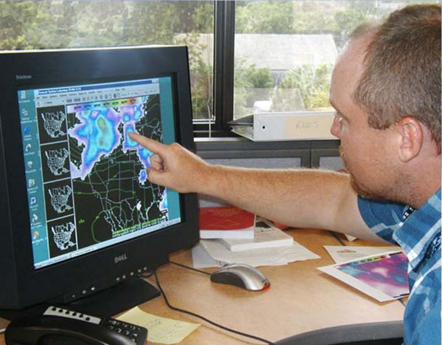
Fire Weather Forecaster Using FX-Net (GACC Office – Lakewood, Colorado)

When in the field and without access to FX-Net or Gridded FX-Net, GSD provides a Grid Extraction Tool, Web Interfaced (GETWI) to forecasters needing access to model information.