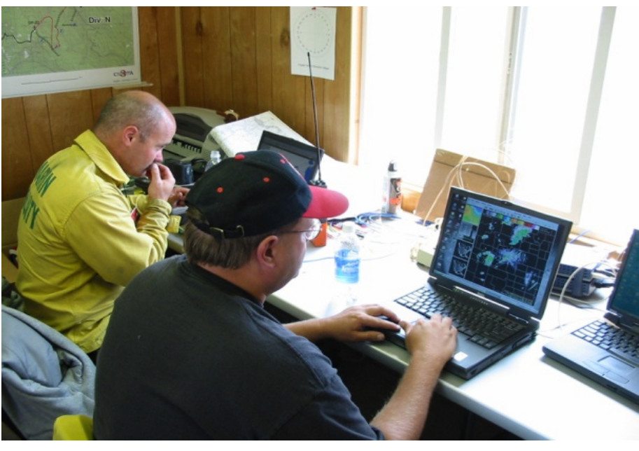
IMET Briefing Fire Behavior Analyst on a California Fire