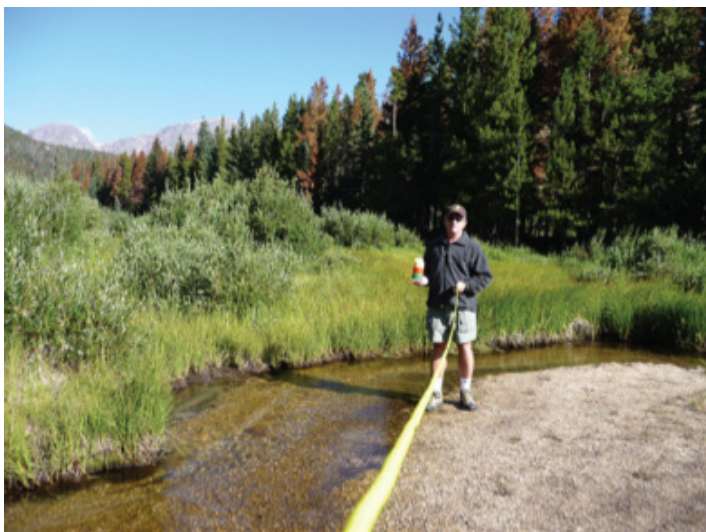
Figure 3: Sampling for water quality in a beetle-affected watershed in Rocky Mountain National Park, Colorado, in August 2009.