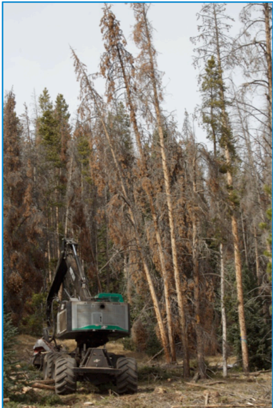
Figure 4: Harvesting with a feller-buncher in a beetle-killed lodgepole pine stand in North Park, Medicine Bow-Routt National Forests, Colorado

region on MPB-water questions, it is not a complete picture of the state of the science, and there are many unanswered questions that will drive the science in new directions. As new research and monitoring is conducted, the picture of MPB-water impacts will undoubtedly change. WWA will continue to help resource managers and other decision-makers stay informed of developments in this fast-moving area of research. We encourage readers who want more information about these studies to contact the presenters directly, and to contact us ( wwa@noaa.gov ) with suggestions on how the communication of MPB research to stakeholders can be improved.