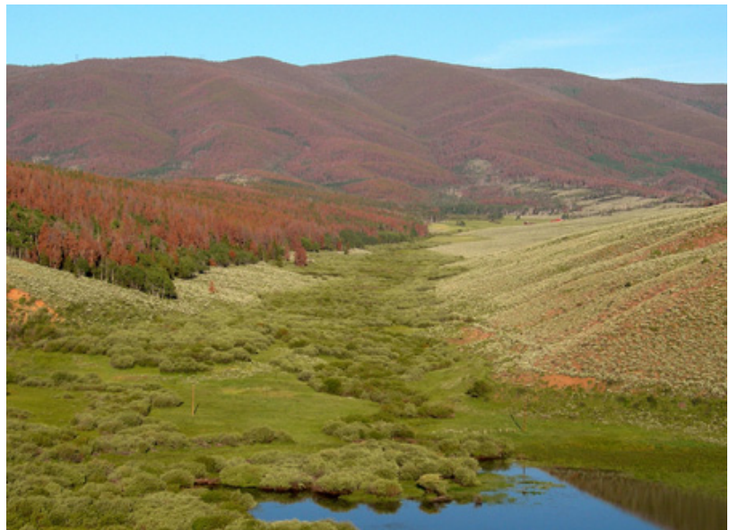
Figure 1: As watersheds experience significant tree mortality from mountain pine beetle, how will the hydrologic cycle and water quality be affected? (Williams Fork Mountains, Colorado; Photo: US Geological Survey)

The day began with a presentation by US Forest Service hydrologists Liz Schnackenberg and Carl Chambers on the outstanding questions regarding MPB impacts of greatest relevance to their agency. They split these questions into “natural processes” (what are the impacts of MPB-killed forests on water yield, peak flows, sediment yield, stream channel stability, woody debris inputs to streams, riparian areas, and groundwater) and “management effects” (how will salvage logging and associated road-building modify these impacts).