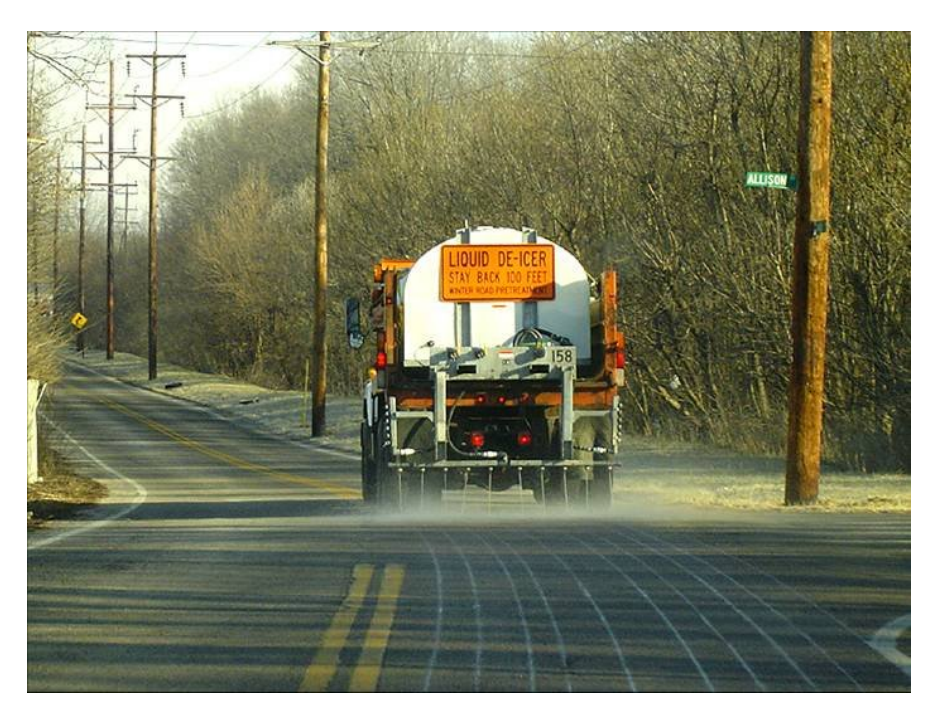
Figure 4: Department of Transportation truck sprays calcium chloride on an arterial road in Wake County, NC prior to an impending winter storm.

Figure 3: Example of aggressive tree-trimming around power lines in Forsyth County, NC.