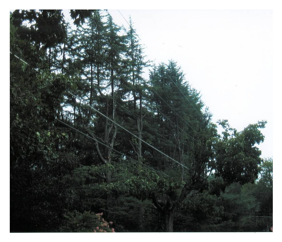
Figure 3: Example of aggressive tree-trimming around power lines in Forsyth County, NC.