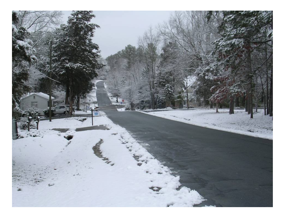
Figure 2: A local road in Wake County, NC following a moderate snowstorm. Note the accumulation of snow on trees and non-paved surfaces, while the warmer asphalt has prevented any accumulation.