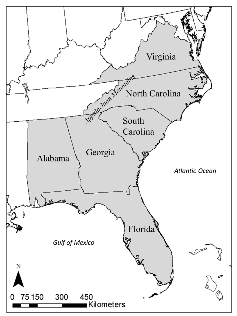
Figure 1. Map of the southeastern states included in this study.