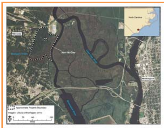
Figure 2. Aerial map showing the restoration site at the Kerr-McGee former wood-treatment processing plant in Navassa, North Carolina

It is anticipated a public scoping meeting will be held in summer 2015 with funds becoming available for restoration projects in fall 2015.