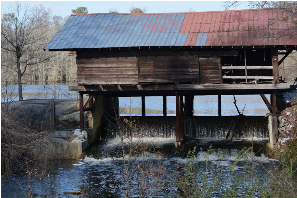
Boney Millpond Dam, natural barrier may make this a low priority.