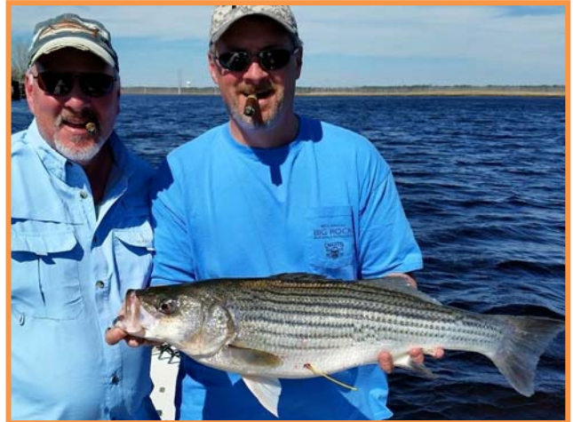
Photo of striped bass in the Cape Fear River. (Photo credit Captain Jason Dail).

The Partnership strives to measure achievement of our mission with the following targets: increased fish populations (as measured by catch-per-unit efforts, improved age structure, and other techniques), increased recreational fishing success for shad, striped bass, and river herring (as measured by creel surveys), and a re-opened striped bass and river herring harvest in the Cape Fear River.