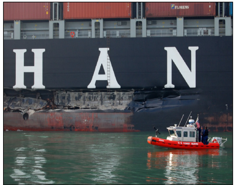
Hole in the Cosco Busan container ship, which spilled 53,000 gallons of oil in San Francisco Bay in 2007.