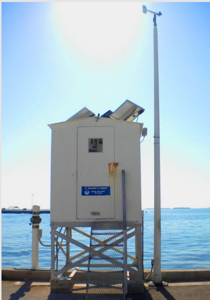
Tide gauge station in Key West, FL.