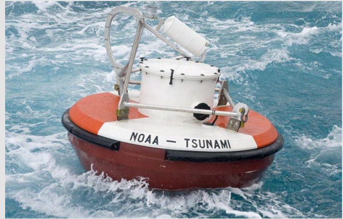
DART Buoy deployed.

The DART system is a global array of 62 offshore seabed bottom pressure recorders (BPRs) which detect the tsunami by increased pressure from the wave passing over. Real-time data are transmitted to a nearby surface buoy, which relays the message to tsunami warning centers via satellite that a tsunami is on the way. DART observations confirm the existence or absence of a tsunami far from the coast. High-resolution delayed-mode data are stored onboard the BPR, and, after recovery, are sent to NCEI for archive and processing.