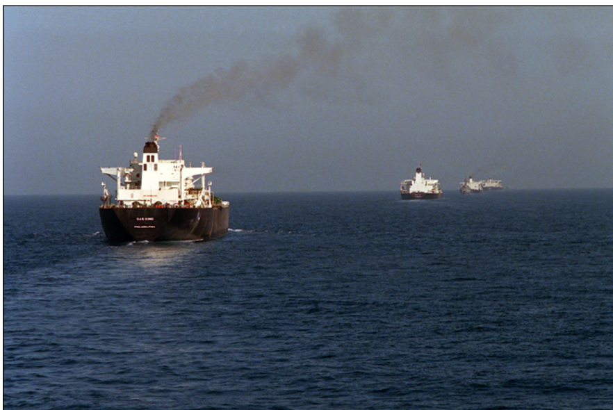
A convoy of reflagged Kuwaiti tankers, under US Navy escort, moves through the Persian Gulf on 22 August 1987. The nearest ship is the SS Bridgeton , which had struck a mine the month before.

The debate spread out in various forms once Earnest Will started, but the IC arguments in May and June 1987 reflect dynamics recurring over