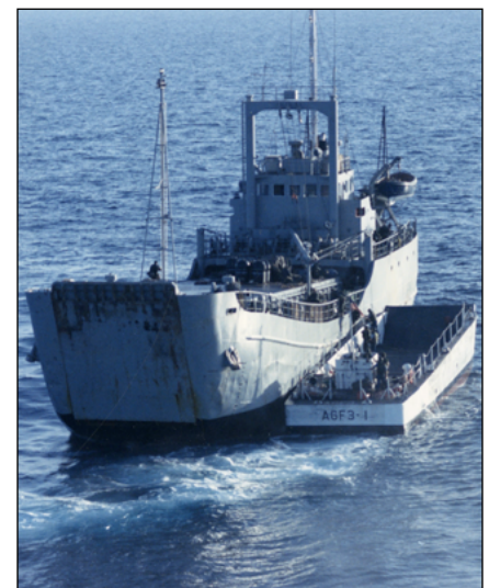
The Iran Ajr .

The IC leaned forward to improve the amount and speed of tactical warning to the operating forces, judging from declassified accounts. National Security Council (NSC) meetings revealed that by May 1987 the United States was approaching Saudi Arabia to extend AWACS coverage in the Gulf and in June 1987 that Washington was preparing to orchestrate satellite coverage, AWACS flights, and P-3 maritime patrol aircraft on behalf of Earnest Will . 37 The National Photographic Intelligence Center (NPIC), forerunner of today’s National Geospatial-Intelligence Agency, dove into the Silkworm threat, a major concern for policymakers as well as for Earnest Will convoys having to brave the Strait of Hormuz.