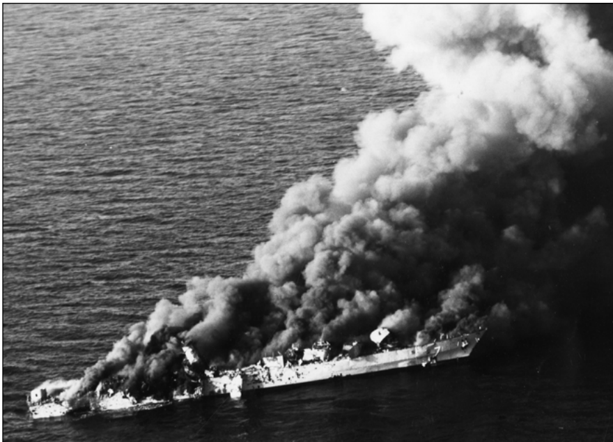
An Iranian corvette burns after a US air strike conducted during Operation Praying Mantis in the summer of 1988.

After the follow-up testimony on 19 June, CIA concluded that in this case the differences were based more on semantics than on policy disagreements, with CIA analysis extending out to a year compared to the two-month timeframe of the DoD white paper. Unlike the white paper, the CIA analysis also had highlighted the danger to US and Western interests posed by Iranian terrorists responding