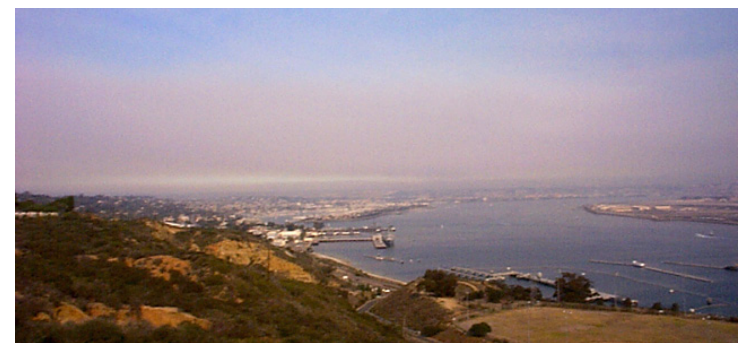
A view of smoke over San Diego on 3 January 2001, as the Viejas Fire raged to the east.

Fires produce a stronger signal in the mid-wave IR bands (around 4 microns) than they do in the long wave IR bands (such as 11 microns). That differential response forms the basis for most Fire Detection and Characterization ( FDC ) algorithms, including the algorithm used for GOES-R. FDC was taken into account when creating the specifications of the 3.9 micron band on ABI, allowing GOES-R