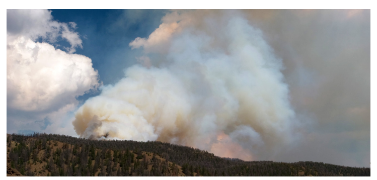
Forest fire over a hill just east of Yellowstone National Park, along US 20, on 10 August 2008.

Fires, whether naturally occurring or man-made, have substantial impacts upon society. Wildfires can destroy vast tracts of land, releasing tons of aerosols and gases into the atmosphere, while destroying wildlife habitats and valuable resources. According to the National Interagency Fire Center, wildland fires burned an average of 4,641,405 acres per year in the U.S. from 1985-2008. Recording and monitoring fires from ground-based observations is a labor intensive, expensive process that results in an incomplete record. Satellites allow for detecting and monitoring a range of fires, providing information about the location, duration, size, temperature and power output of those detectable fires that would otherwise be unavailable. This information can be used to track fires in real time, providing input data for air quality modeling and helping to separate the impact of the fires from other sources of pollution.