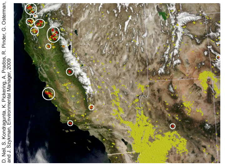
NOx (oxides of nitrogen that are precursors to photochemical smog) emissions derived from GOES observations for July 2008 forest fires in California. Nearly 1.3 million acres of forest land burned in June and July 2008, releasing several tons of NOx into the atmosphere. On certain days in July 2008, NOx emissions in northern California were as high as 325 tons, quite substantial compared to anthropogenic emissions which are generally below 10 tons for regions where fires occurred. Emissions less than 40 tons are shown in yellow and emissions greater than 40 tons in red.

Aerosols (suspended particulate matter) are a key component of urban/industrial photochemical smog that leads to deteriorated air quality. They are also the primary pollutant in natural environmental disasters such as volcanic eruptions, dust outbreaks, biomass burning associated with agricultural land clearing and forest fires. Aerosols are detrimental to human health and the environment. High concentrations of aerosols, when inhaled, lead to upper respiratory diseases including asthma. They decrease visibility and lead to unsafe conditions for transportation. The Environmental Protection Agency (EPA) estimates that more than 106 million people in the United States live in areas of poor air quality, costing about $143 billion dollars per year in hospital expenditures. Aerosols are also a major climate-forcing component. They affect the radiative balance of the Earth, cooling or warming the atmosphere (depending on aerosol composition).