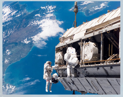
Astronauts working outside the International Space Station are especially vulnerable to radiation from solar storms.

significantly improve space weather forecasts and provide early warning of possible impacts to Earth's space environment and potentially disruptive events on the ground.