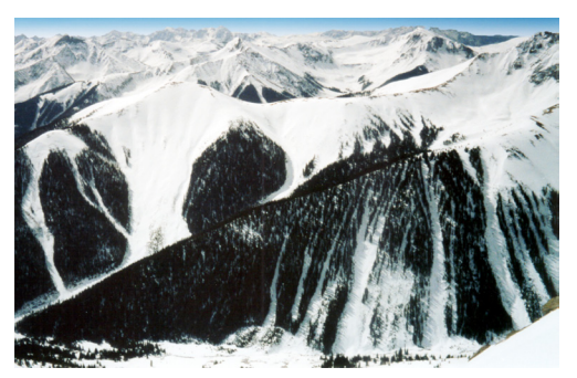
Above: San Juan Mountains, Colorado – a prominent contributor of snowmelt runoff to the Colorado River. Right: Snow Cover maps will be coordinated with mountain weather stations for integrated operational hydrologic forecasting.