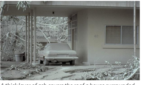
A thick layer of ash covers the roof a house surrounded by broken branches and trees without foliage due to volcanic ash fall from the eruption of Mount Pinatubo on June 15, 1991.

Current GOES operational volcanic cloud products are qualitative, primarily due to sensor limitations. Improved spatial resolution and a large selection of spectral channels will enable the GOES-R Advanced Baseline Imager (ABI) to generate more advanced quantitative volcanic cloud products. The GOES-R series Volcanic Ash Detection product will provide objective estimates of ash cloud coverage, height, mass and particle size which are necessary to issue Significant Meteorological Information (SIGMET) advisories for aircraft and accurately forecast the dispersion of ash clouds.