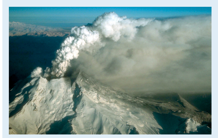
Image of the December 1989 Mt. Redoubt eruption (upper) demonstrates that a large quantity of volcanic ash can be rapidly injected to aircraft cruising level. Heavy ash fall from this eruption also caused significant engine damage to a KLM passenger jet (lower).

Airborne volcanic ash is a major aviation, health and infrastructure hazard. When ingested into aircraft engines, volcanic ash can lead to engine damage or failure. For example, in December 1989, a 747 jetliner carrying 231 passengers encountered an ash cloud during an eruption of the Mount Redoubt volcano, located southwest of Anchorage, Alaska. Within 60 seconds of encountering the heavy ash cloud, all four engines of the aircraft had stalled. Fortunately, the pilot was able to restart the engines, narrowly avoiding a crash. Volcanic ash is extremely abrasive and even small concentrations can cause severe damage to the exterior of aircraft. In addition, ash falls pose significant health and infrastructure threats to those on the ground. Breathing volcanic ash can result in serious illness or death and ash falls can also pollute water supplies and damage or destroy buildings.