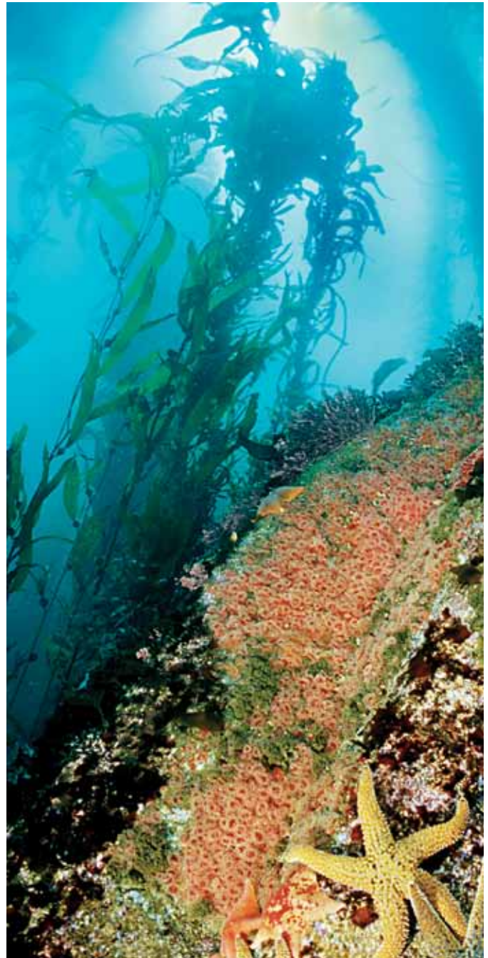
PACIFIC ECOSYSTEM. A kelp forest is home to an ochre sea star in Monterey Bay, California.