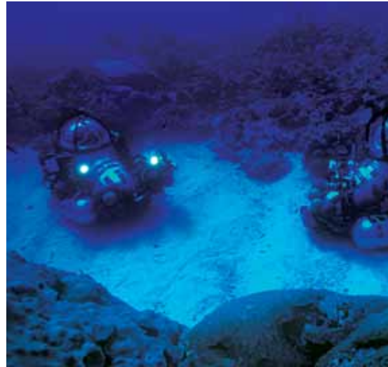
UNDERWATER EXPLORATION. Deep Worker submersibles explore the Flower Garden Banks National Marine Sanctuary in the Gulf of Mexico.