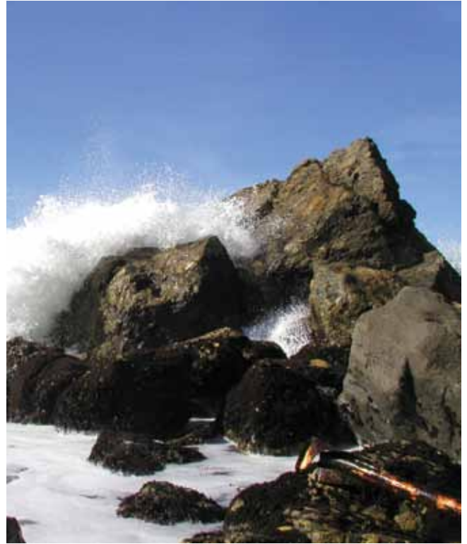
COASTAL CARVINGS. Waves crashing on the coast of Big Sur, California near the site of the F/V Bono crash.