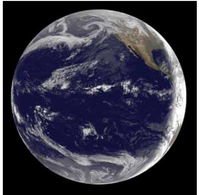
THE OCEAN FROM SPACE. This infrared image from the GOES-11 satellite shows the Pacific Ocean.

E Most of Earth’s water (97%) is in the ocean. Seawater has unique properties. It is salty, its freezing point is slightly lower than fresh water, its density is slightly higher, its electrical conductivity is much higher, and it is slightly basic. Balance of pH is vital for the health of marine ecosystems, and important in controlling the rate at which the ocean will absorb and buffer changes in atmospheric carbon dioxide.