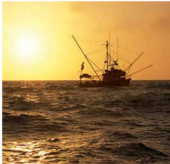
THE DAY'S CATCH. A commercial fishing vessel off the coast of Santa Cruz, California returns to port.