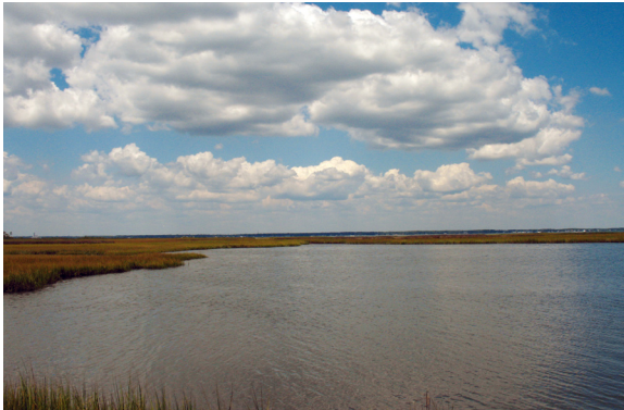
Marsh at Goodwin Islands, Chesapeake Bay Virginia National Estuarine Research Reserve

inundation (Stedman and Dahl 2008). The biologically rich habitats of estuaries and coastal watersheds provide essential functions such as nurseries for many commercially important fish and shellfish as well as protection for human communities from storm surge, storm water run-off, and flooding. Current stressors on coastal habitats will be amplified by climate change causing greater habitat loss and alteration. Reserves are well suited to map, monitor, and investigate habitat changes and develop, test, and implement methods for habitat protection and restoration. Reserves also transfer these best management practices through coastal training and community education programs.