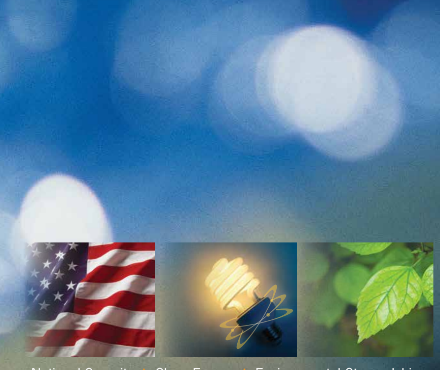
National Security | Clean Energy | Environmental Stewardship

Thank you for your attention to our "point of entry" safety and security briefing. With your help, the Savannah River Site will continue to be an injury-free and accident-free workplace.