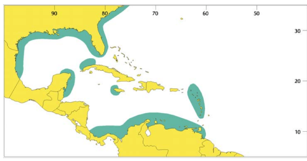
Figure 3: Range of Caribbean Electric Ray.

where the species is referred to as the N. brasiliensis (Carvalho et al. 2007). It is uncertain in these records whether documented N. brasiliensis truly represent N. bancroftii. Id. The Caribbean Electric Ray's existence in the Bahamas has not been confirmed. Id.