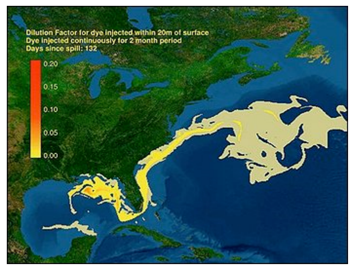
Figure 4: The Estimated Range Impacted by the Gulf Oil Spill.

The oil spill in the Gulf of Mexico will have lasting effects on both marine and coastal habitat required by the Caribbean Electric Ray. An oil spill can cause extensive mortality throughout the marine ecosystem from the basic foundations of phytoplankton, algae, coral and seagrass to the largest and most mobile organisms.<sup>12</sup>