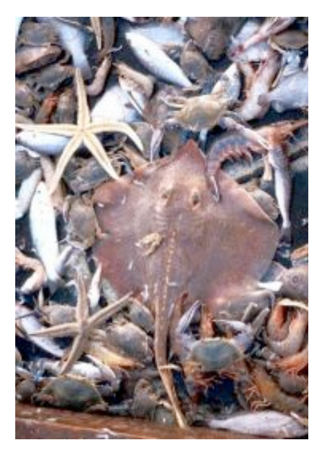
Figure 5: Shrimp trawl catch. 95% of the catch in this photo that was not shrimp died on deck and was discarded overboard.<sup>18</sup>

Gulf commercial fisheries are some of the most productive in the world. The Gulf supports four of the top seven fishing ports in the nation by weight and eight of the top twenty fishing ports in the nation by dollar value (EPA 2010). According to NMFS, the 2008 commercial fish and shellfish harvest from the five Gulf states (Louisiana, Alabama, Mississippi, Florida, and Texas) was estimated at 1.3 billion pounds valued at $661 million. Id. Shrimp trawls are a large part of these commercial fisheries, leading the nation in 2008 with about 73% of the nation's total harvest. Id.