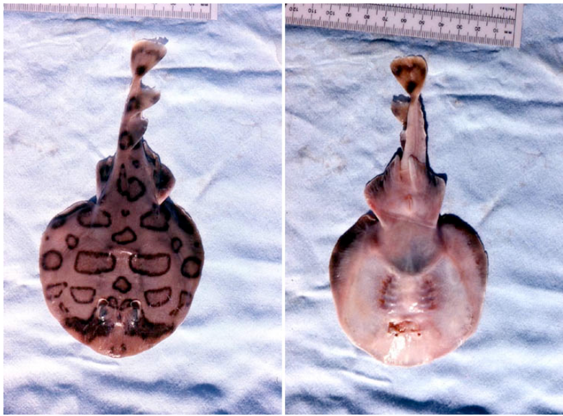
Figure 1: Photos of the Caribbean Electric Ray. Source: Florida Museum of Natural History<sup>3</sup>

N. bancroftii is a small, shallow water ray found on soft, sandy substrates from the intertidal zone to depths of 35 meters (Carvalho et al. 2007). The Caribbean Electric Ray is one of nine genera and 24 species in the Narcinidae family but is the only electric ray that inhabits shallow waters along the United States coastline. It can be distinguished from other electric rays by its moderately long snout and a preorbital length of 11%-13% of its total length (Press 2010).