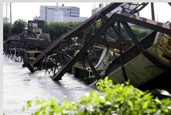
Flooding Impact on Bridge in Cedar Rapids, Iowa, July 2008

Iowa has experienced catastrophic flooding three times in the past 17 years. The floods of 2008 rank in the top ten natural disasters in U.S. history and highlight the risks of Iowa’s changing climate. The EPA and FEMA worked with stakeholders in Iowa in 2010 to coordinate hazard mitigation with current and future land-use decisions to increase community safety and help reduce economic losses from future flooding. EPA and FEMA are also coordinating to help other communities make cost-effective choices for housing and infrastructure systems that reduce climate risks to communities.