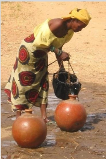
Woman gathering low-quality water from an open well in Matameye, Niger

The Federal Government has made progress toward the Task Force's policy goal of enhancing efforts to lead and support international adaptation. This progress is evident from (1) the development of a government-wide strategy to support multilateral and bilateral adaptation activities and to integrate adaptation into relevant U.S. foreign assistance programs; (2) delivery of targeted adaptation finance to support activities that reduce the risks of climate change and extreme weather through multilateral and bilateral channels; (3) design and implementation of complementary development, diplomacy and defense policies and actions that form an integrated approach to climate adaptation; and (4) outcomes from engagement in international climate negotiations and the global Adaptation Partnership.