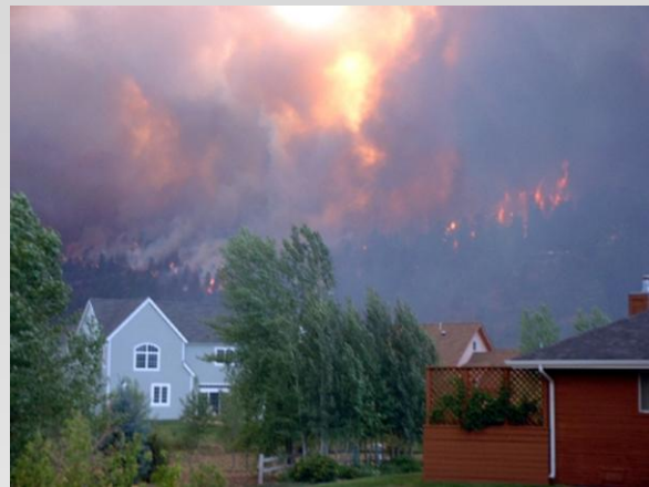
2002 Valley Fire that burned San Juan National Forest lands and many homes located at the urban interface

The average temperature in the Southwest has increased roughly 1.5°F since the 1970s (USGCRP 2009: www.globalchange.gov/publications/reports ). As a result, snowmelt is occurring earlier and more spring flooding and lower summer stream levels are projected for the future. Under the Service First initiative, the Bureau of Land Management's (BLM) San Juan Field Center and the U.S. Forest Service are working together at the San Juan Public Lands Center, which covers over 2.5 million acres in Southwestern Colorado. In the past year, the partners have developed a drought vulnerability model, a carbon storage map, an alpine monitoring program, and projections of future temperature and precipitation patterns. These tools and information will be used to adjust the timing of grazing allotments to ensure adequate vegetation and help land managers choose different tree species to plant that are more resilient to drought, fire, and pests.