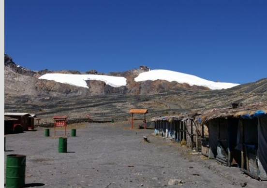
Pastoruri Glacier, Peru