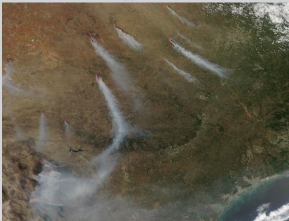
Satellite Image of Texas Fires

Federal agencies are providing scientific information and tools to help decision makers prepare for, respond to, and reduce the threat of fire to minimize fire-related loss of life and damages.