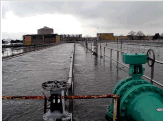
Treated sewage backed-up at Bronx Water Pollution Control Plant

In 2009, EPA worked with the New York City Department of Environmental Protection (DEP) to pilot the Climate Resilience Evaluation and Awareness Tool (CREAT). CREAT is a software tool designed to assist drinking water and wastewater utility owners and operators in understanding potential climate change threats to their utilities. CREAT allows users to assess adaptation options to address climate-related impacts using both traditional risk assessment and scenario-based decision making. The DEP is now using the tool to complement a comprehensive study to develop an adaptation strategy to address increasing population demand for water services and minimize impacts of heavy rain and storm surge to New York City's drainage and wastewater management systems.