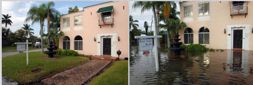
Inundation (right) from a high tide in Fort Lauderdale, Florida

Southeast Florida is already experiencing the impacts of extreme weather and sea level rise, compromising drainage systems and sea walls during high tide events. With continued sea level rise and the prospect of more intense hurricanes and heavy downpours, the region faces greater risks of flooding, safe water supply shortages, infrastructure damage, and natural resource degradation. In response, Broward, Miami-Dade, Palm Beach, and Monroe Counties entered into the Southeast Florida Regional Climate Change Compact in 2010 to address these threats collaboratively. The South Florida Water Management District and Climate Leadership Initiative have been prominent partners in this effort.