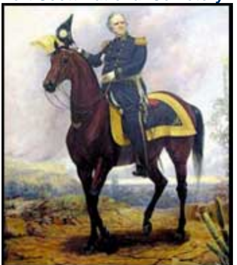
Gen. Winfield Scott

Fort Scott, located on the eastern outskirts of the city of Fort Scott, Kansas, was established in 1842 to keep a three-way peace between Native American tribes who were forced off of their lands in the east, the area's local tribes and white settlers. It was named for Gen. Winfield Scott (b.1786), one of the top military heroes of his time.