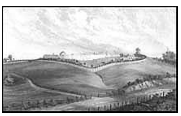
Historic Fort Mitchell

Located just over the Georgia line in Seale, Ala., Fort Mitchell was designated a national cemetery in 1987, but its graves date back to World War I. The fort itself was built by the Georgia Militia in 1813, offering protection to European settlers heading west and serving as a staging area for military excursions into Creek Indian Territory.