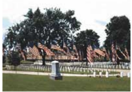
Fort Smith National Cemetery in Arkansas

At the edge of the Arkansas- Oklahoma border lies Fort Smith, Arkansas' second-largest city. Its beginnings lay in the founding of "Camp" Smith on Christmas Day, 1817.