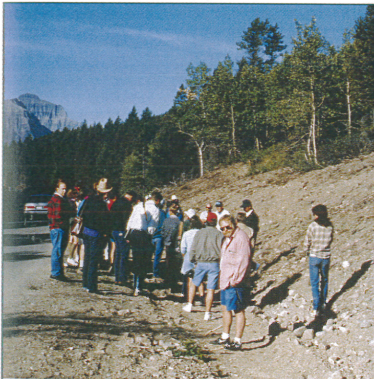
Revegetation of road cuts with native vegetation in Glacier National Park, Montana, requires detailed planning and cooperation between partners. The National Park Service, the U.S. Department of Transportation and the Natural Resources Conservation Service are working together on this project.

Private landowners, State and Federal land management agencies, weed organizations, and interest groups should establish priorities and coordinate control efforts based on areawide invasive plant management plans.