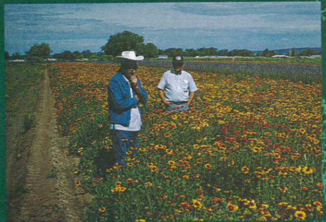
These native flowers are grown commercially and made available for restoration projects or to individuals interested in growing native wildflowers.

Opportunities for research: Research is needed to identify the most effective means of seed harvest and propagation for a wide range of native plants. Cleaning methods for removing invasive plant seed from native plant seedlots can be developed so that weed-free certification is feasible. Methods to maintain native plantings, especially during the first few years, must be developed or improved. Additional controlled breeding and selection of native plants may be needed to ensure horticultural value, landscape adaptability, and consumer acceptance.