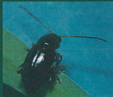
Leafy spurge flea beetle.

Opportunities for research: Research is needed to identify, evaluate, and clear new biological and chemical controls that are safe, effective, and target-specific. Site-specific studies are needed to determine the best combinations of these controls.