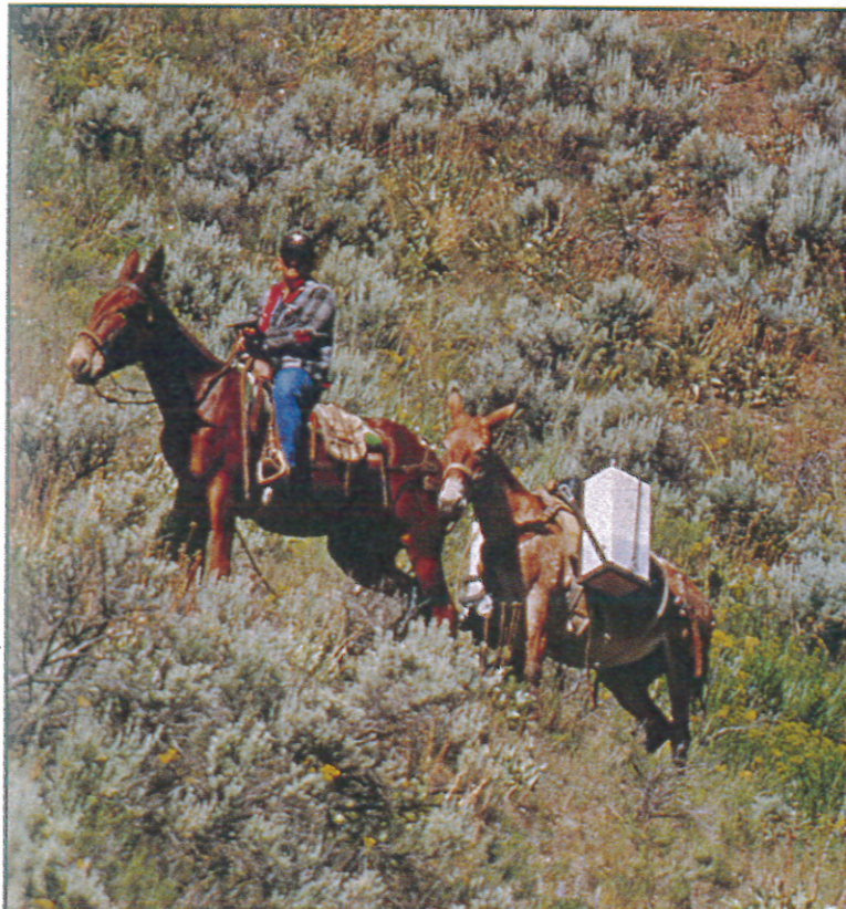
Mules carry equipment into remote areas to conduct selective spraying. Catching small infestations early is the most effective approach.

Early eradication of a small infestation will save significant time and money and will be more successful than attempts to eradicate the infestation after it becomes substantial. An expansive infestation should be contained by preventing the edges from advancing, with long-term control efforts, such as biological control, focused on the core.