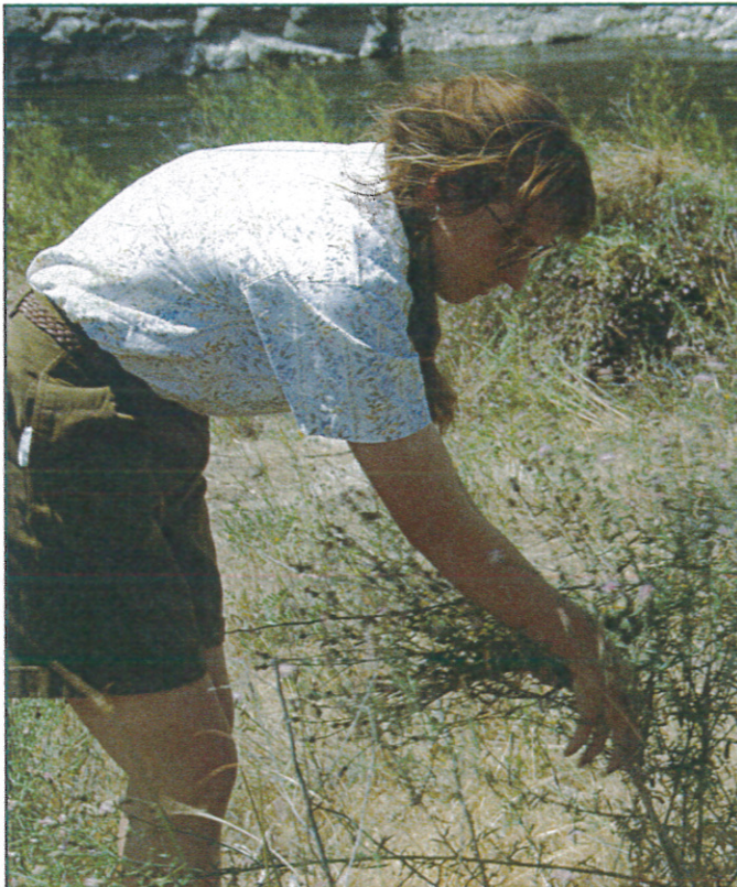
Working together, people can make a difference. This volunteer is pulling spotted knapweed from a recreation site along the Snake River in Idaho before the infestation becomes unmanageable.

This objective brings the National Strategy full circle and back to National Goal 1, Prevention. If we can maintain restored lands, we will certainly be making progress. Certain land uses and activities are more likely to contribute to natural environments, and these should be encouraged.