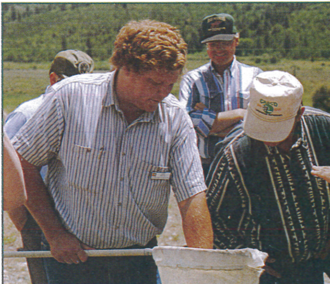
Beetles are used as a biocontrol agent on leafy spurge at Lake Avery near Meeker, Colorado.

Integrated invasive plant management relies on a combination of technologies. Cooperation is essential for control when infested areas include several landowners because invasive plants respect no boundaries. Factors to consider in selecting control technologies include compatibility, effectiveness, and environmental effects. Control technologies include biological, mechanical, chemical, and cultural applications. Because of the complexity of environmental, economic, and cultural concerns associated with invasive plant management, programs that are based on a combination of technologies tend to be most successful.