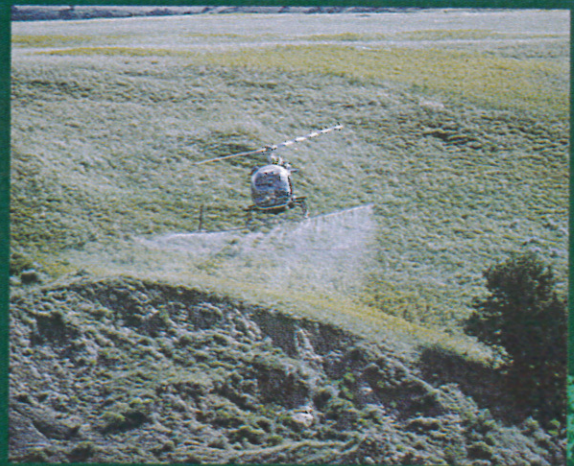
Theodore Roosevelt National Park in North Dakota treats moderate-sized areas of leafy spurge in remote areas to prevent the plant from expanding or spreading.

Opportunities for research: Eradication and control technologies for new invasive plants will be needed. Studies are needed to determine what conditions make ecosystems vulnerable to invasion so these conditions can be considered in preventing the spread of invasive plants. For many large invasive plant infestations, more work is needed to identify suitable integrated invasive plant management techniques for use in natural resource areas.