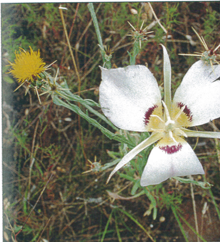
Native species: Rare Calochortus only found in Hells Canyon in Idaho. Yellow starthistle (left) threatens this delicate native plant.

Native plant species provide forage, cover, and habitat required by native fauna. Use of native species for landscaping, rights-of-way, erosion control, and habitat improvement will help prevent the inadvertent spread of nonnative invasive plants and help maintain local biodiversity.