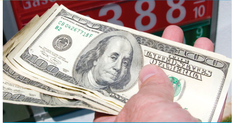
Our gas-saving tips can help you use less fuel and save money.