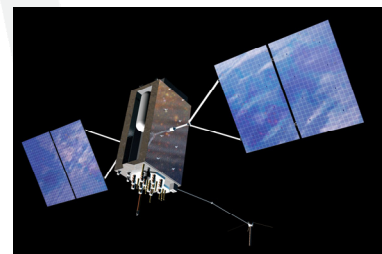
GPS III satellite

Indeed, the probability of favorable satellite geometries is expected to improve as a result of the combination of both systems. Moreover, new safety of life applications will be enabled by the combined processing of GPS and Galileo signals. With a dual constellation, the computation of receiver autonomous integrity monitoring (RAIM) can be improved. As soon as the number of operational Galileo satellites becomes significant, the availability of RAIM will be boosted, thus enabling the ability of self-detection and isolation of faulty signals at any time and any place.