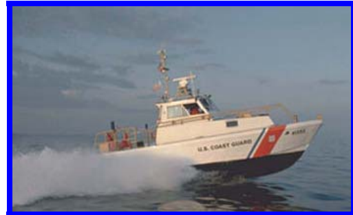
41-Foot Utility Boat

The RB-M project is a two-phase procurement to quickly acquire and field an operationally effective and suitable craft to meet Coast Guard needs. The first phase allowed the Coast Guard to select the most operationally effective test boat to meet its needs. After the test boat selection, the Coast Guard initiated the second phase to procure 180 RB-Ms. In 2006, the Coast Guard awarded a firm fixed-price contract to Marinette Marine Corporation for boat design and production. The contract consists of a base period of 5 years with an option period of an additional 3 years. Production began with the delivery of the first boat in March 2008. As of November 2010, the RB-M project had delivered 41 boats, with 19 additional boats currently in production. The project expects to reach full operating capability by the end of fiscal year (FY) 2015, producing approximately 30 boats per year.