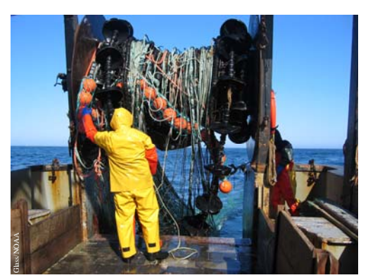
Hauling in a Ruhle trawl.

Sea scallop fishery chain mat.