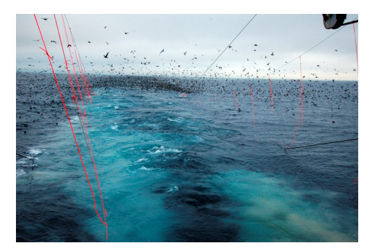
Streamer lines deployed aboard an Alaskan fishing vessel.

The underside of a red king crab: Kodiak, Alaska-2005.