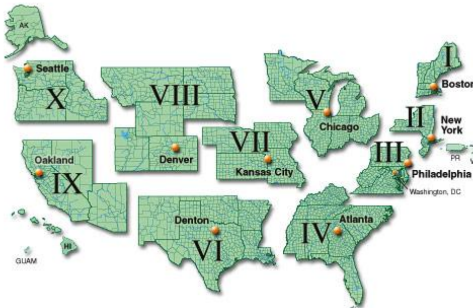
Figure 1. FEMA Regions I–X

The Central Regional Office within the Office of Emergency Management Oversight (EMO), Department of Homeland Security (DHS), Office of Inspector General (OIG), is responsible for conducting audits of grants and subgrants awarded by FEMA Regions V, VI, and VII. The Central Regional Office is also responsible for monitoring follow-up activities necessary to resolve and close recommendations resulting from those audits. FEMA Region VI is responsible for FEMA grant and subgrant activities in five states, as illustrated in figure 1. Therefore, the Region is also responsible for working with us to resolve recommendations and implement actions to close those recommendations in a timely manner.