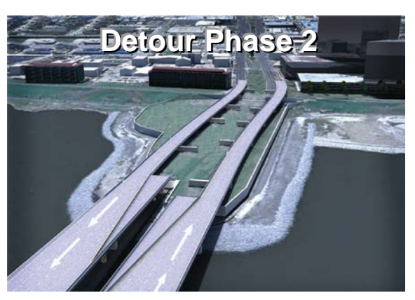
In the second phase of construction Causeway travel lanes were detoured onto the newly constructed elevated lanes.