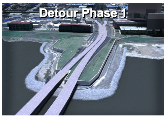
In the first phase of construction, the Causeway travel lanes were detoured into the median.