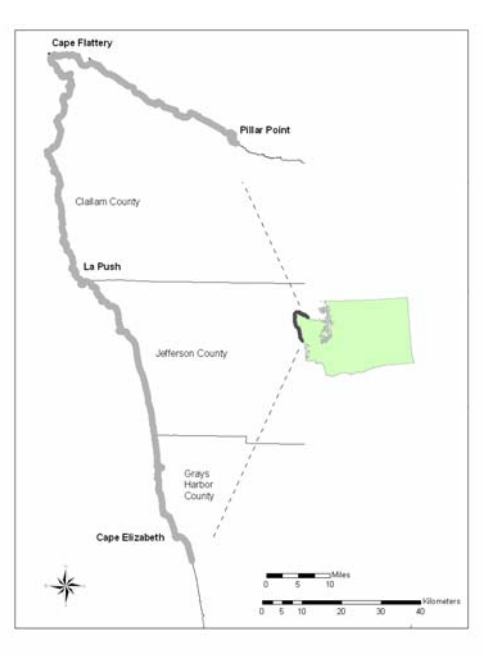
Figure 1. Approximate distribution of Washington sea otter stock.

The northern sea otter, Enhydra lutris kenyoni, historically ranged throughout the North Pacific, from Asia along the Aleutian Islands, originally as far north as the Pribilof Islands and in the eastern Pacific Ocean from the Alaska Peninsula south along the coast to Oregon (Wilson et al. 1991). In Washington, areas of sea otter concentration were reported from the Columbia River to along the Olympic Peninsula coast (Scheffer 1940). Sea otters were extirpated from most of their range during the 1700s and 1800s as the species was exploited for its fur. Washington's sea otter population was extirpated by the early 1900s. In 1969 and 1970, a total of 59 sea otters were captured at Amchitka Island, Alaska, and released near Point Grenville and LaPush off Washington's Olympic Peninsula coast (Jameson et al. 1982; Jameson et al. Washington's current sea otter population 1986). originated from the Amchitka Island genotype (Enhydra lutris kenyoni).