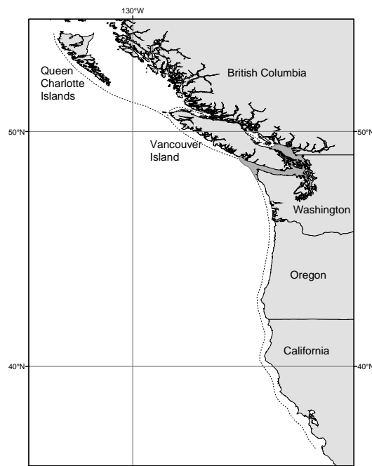
Figure 1. Approximate April-October distribution of the Eastern North Pacific Southern Resident killer whale stock (shaded area) and range of sightings (dotted line).

Based on data regarding association patterns, acoustics, movements, genetic differences and potential fishery interactions, five killer whale stocks are recognized within the Pacific U.S. EEZ: 1) the Eastern North Pacific Northern Resident stock - occurring from British Columbia through Alaska, 2) the Eastern North Pacific Southern