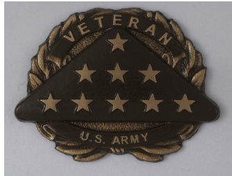
Three inch Medallion