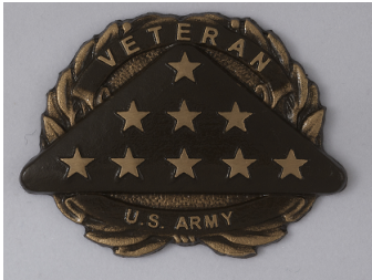
Five inch Medallion

Shown below are the three medallions with the maximum dimensions for height and length.