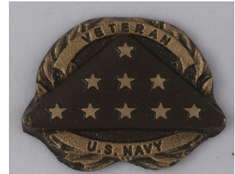
One-and-one-half inch Medallion