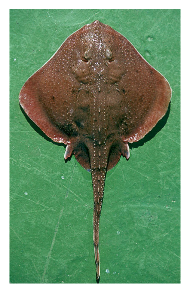
Thorny skate, Amblyraja radiata .

Staff provided training to Regional Fishery Management Council members on the Species of Concern program and SOC species that overlap with those considered by the Councils' to be overfished or undergoing overfishing.