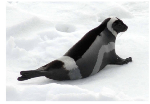
Ribbon seal, Histriophoca fasciata.

Internal funding of $300,000 was competitively awarded to 9 of the 21 projects submitted by NMFS Science Centers and Regions. These included projects for cowcod conservation, Atlantic sturgeon tracking, Pacific hake growth and movement, Hawaiian coral genetics, ribbon seal toxins, Warsaw grouper life history, insecticides as a threat to coho salmon, and green abalone culturing and outplanting. Funds were also to hold a west coast workshop with program partners. For more information on any of these projects contact the Program Coordinator (see pg. 4).