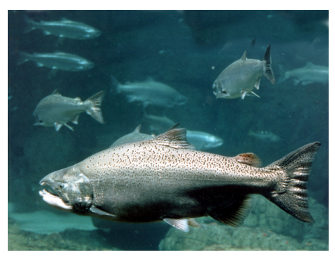
Chinook salmon, Onchorhynchus tshawytscha.

Fact sheets are available for download on the program's website (see pg. 4).