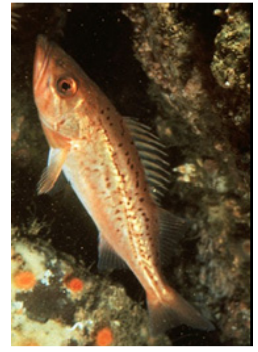
Cowcod, Sebastes levis.