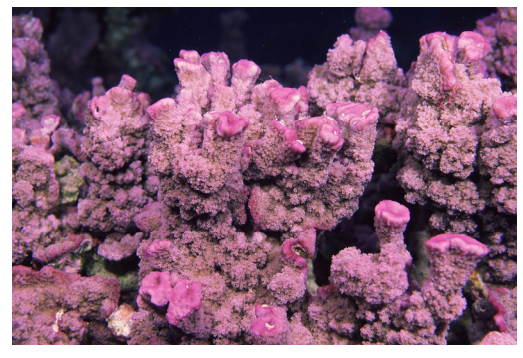
Hawaiian reef coral, Montipora dilitata