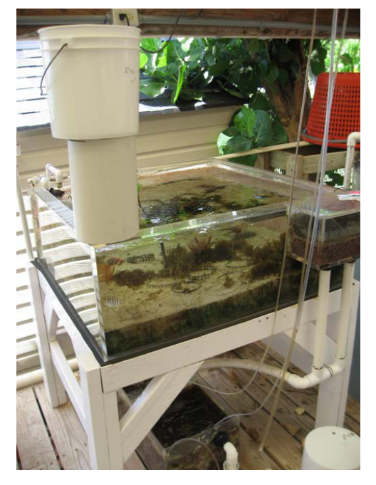
Inarticulated brachiopod ( Lingula reevii ) husbandry tank at Waikiki Aquarium. Waikiki Aquarium.

A new webpage for funding, training, and technical resources for stakeholders partners was developed.