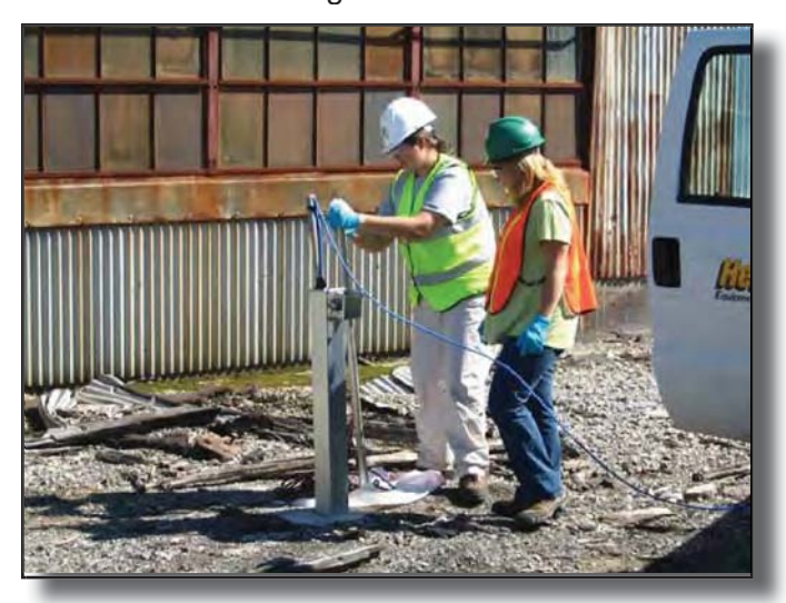
Guterl Site Well Sampling

The 70-acre former Guterl Specialty Steel Site, also known as Simonds Saw and Steel Corporation, is located in Lockport, N.Y. During FY 2009, the Buffalo District continued preparation of a Remedial Investigation Report characterizing radiological contamination at the site. This report was completed and released in FY 2010. A public information session has been scheduled for FY 2011 to update the community on the status of Corps activities at the site. The site Feasibility Study will begin in FY 2011. Annual site monitoring and surveillance will continue.