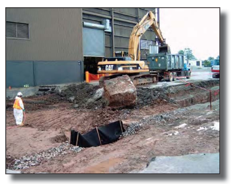
Linde Site Excavation

Located in Tonawanda, N.Y., the Linde Site is a 135-acre site currently owned and operated by Praxair, Inc. The Tonawanda Landfill, a vicinity property to the Linde Site, is reported separately in this update. Along with continuing to remediate the Linde Site soils, the Buffalo District removed several buildings from the site in FY 2009. Remediation of the Linde Site continued in FY 2010 with approximately 172,265 cubic yards of contaminated material excavated and shipped to out-of-state disposal facilities to date. Buffalo District conducted a Five-Year Review to evaluate the effectiveness and protectiveness of selected remedial actions contained within the Record of Decision for the Linde Site soils. Remediation of the site will continue through FY 2012.