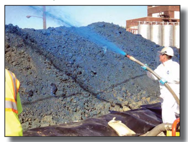
Painesville Site dust control agent application

The Painesville Site, a 30-acre privately owned site 22 miles northeast of Cleveland, Ohio, is currently in the Remedial Action phase. The Buffalo District awarded a remediation contract for the Painesville Site in FY 2009, using funds provided by the ARRA. In the first half of FY 2010 the Buffalo District completed the remediation work plans for the site, and site remediation resumed in June 2010. The Buffalo District sponsored a public availability poster session near the site in April 2010 to inform interested community members about site remediation activities. In FY 2011, the Buffalo District will continue site