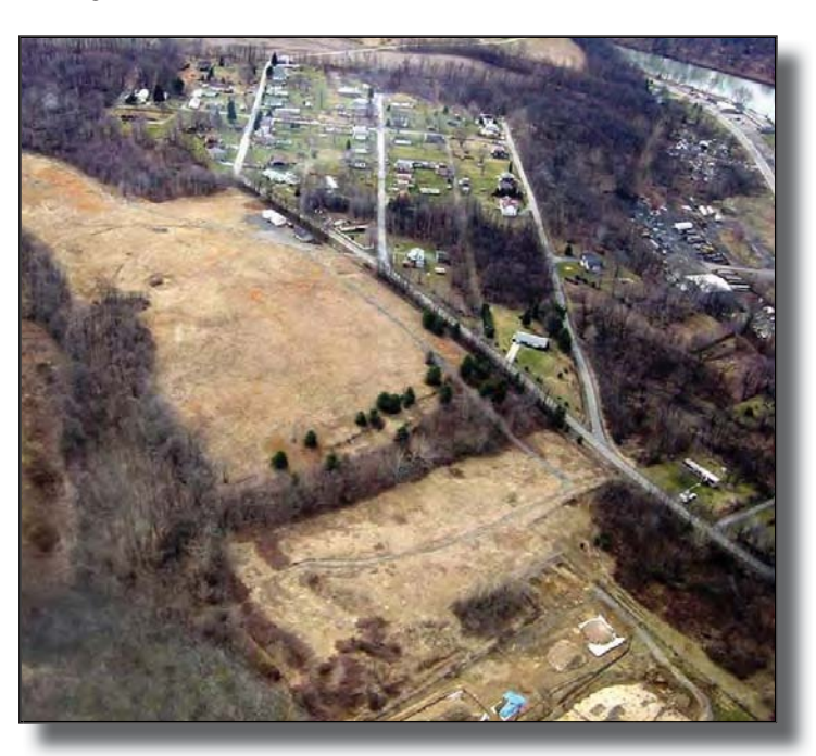
Shallow Land Disposal Area

Excavation of trench material is expected to begin in FY 2011.