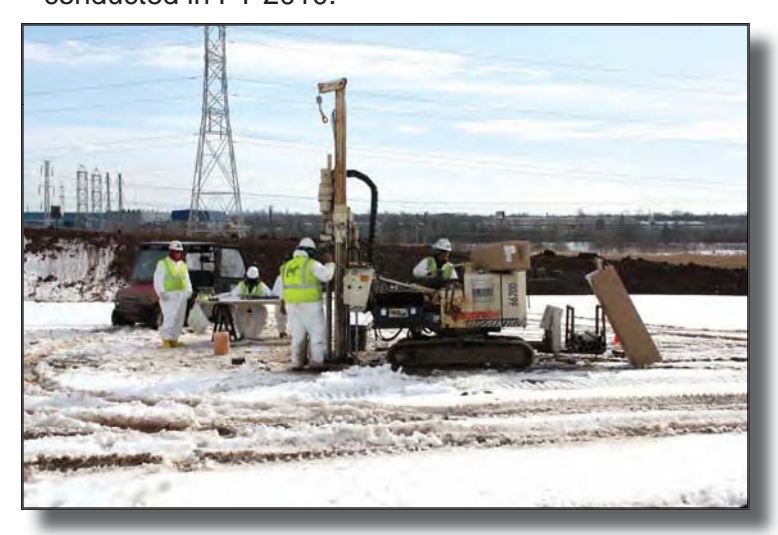
Tonawanda Landfill Soil Sampling

The Buffalo District awarded a contract in FY 2009 to conduct Phase 2 Remedial Investigation sampling in the Landfill OU, using funds provided by the ARRA. The Phase 2 Remedial Investigation sampling was conducted in FY 2010.