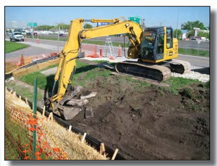
St. Louis Airport Site Vicinity Property Remediation

At the St. Louis Airport Site, where the remedial activity has been completed and the Post-Remedial Action Report has been released, groundwater monitoring and long-term management activities continued into FY 2010.