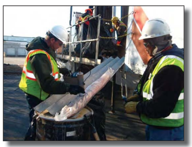
Sylvania Corning, Hicksville

From 1952 to 1965, the Sylvania Corning Plant, located in Hicksville, N.Y., operated under contracts with the Atomic Energy Commission for research, development and production primarily in support of the government's nuclear weapons program. From 1952 to 1967, a second operation concentrated on AEC-licensed work primarily for the production of reactor fuel and other reactor core components.