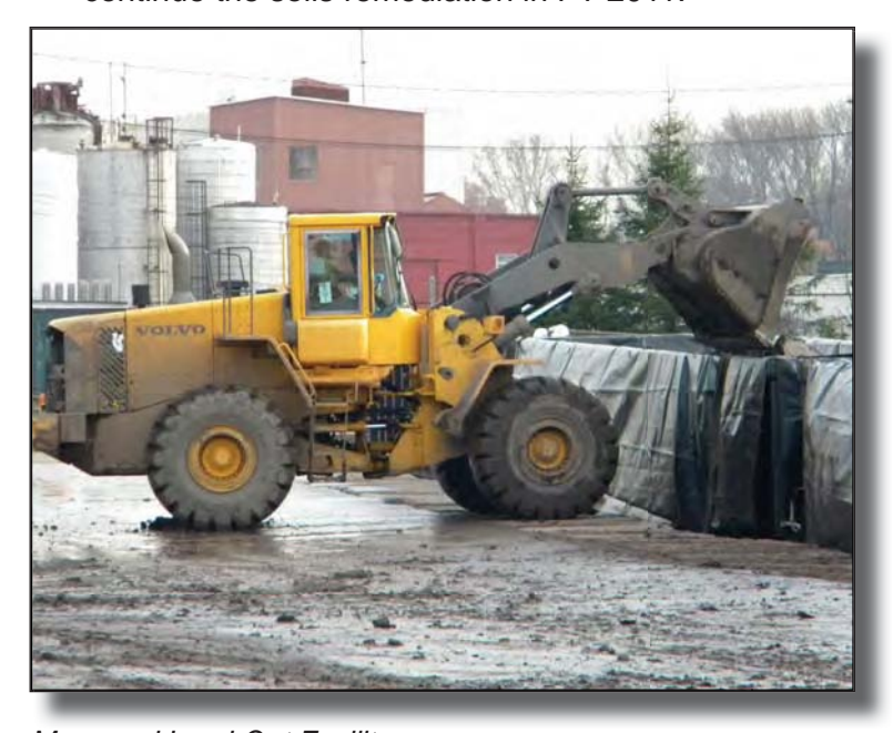
Maywood Load-Out Facility

material have been shipped in FY 2010. Receipt of ARRA funding allowed the acceleration of work in support of proposed infrastructure improvements, beginning remediation of the last two vicinity properties, and acceleration of remediation on two of the largest vicinity properties, including remediation of two NRC-licensed burial pits. The district plans to complete the groundwater Record of Decision and continue the soils remediation in FY 2011.