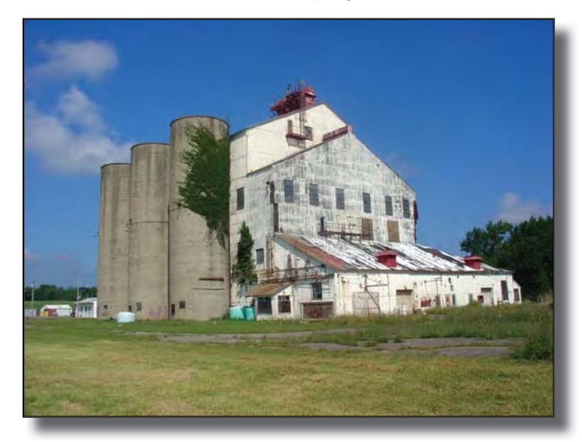
Niagara Falls Storage Site Building 401

with the Feasibility Study. The District will continue to conduct daily site maintenance, monitoring and surveillance activities to verify the integrity of the Interim Waste Containment Structure and continue periodic public workshops with a technical facilitator to allow full community involvement and understanding of the CERCLA process and path forward at this site. The District also intends to expand the site's environmental surveillance program in FY 2011.