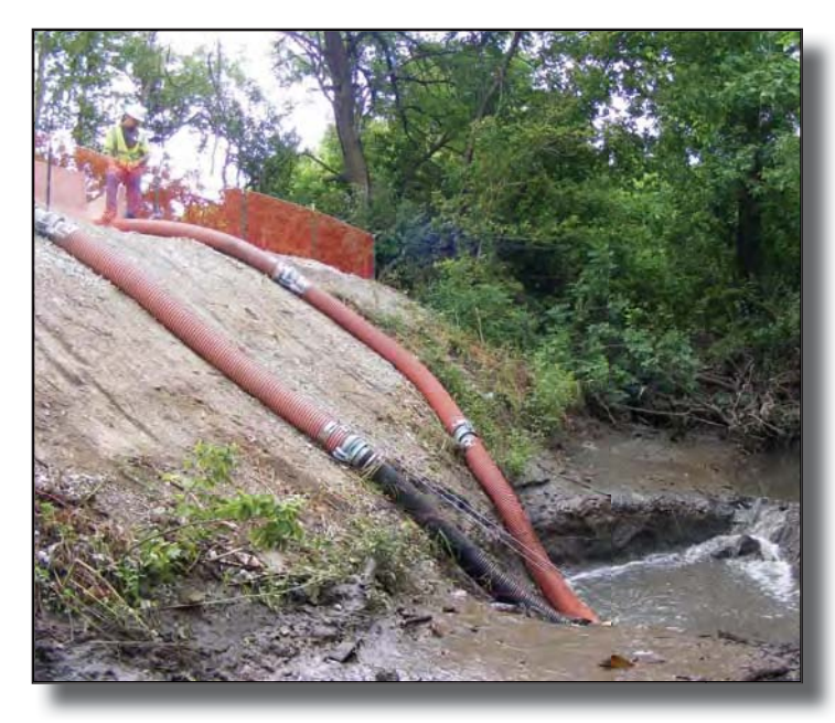
Latty Avenue Site

In FY 2009, the St. Louis District continued remedial activity and documentation for the three sites that comprise the North County St. Louis Sites: St. Louis Airport Site, St. Louis Airport Site, St. Louis Airport Site Vicinity Properties, and the Latty Avenue Properties/Hazelwood Interim Storage Site (HISS). During FY 2010, the Five-Year Review to evaluate the effectiveness and protectiveness of the selected actions in the Record of Decision for the St. Louis Sites was initiated. This Five-Year Review will be released in FY 2011.