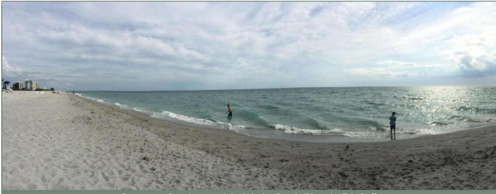
Panorama of newly renourished Venice Beach