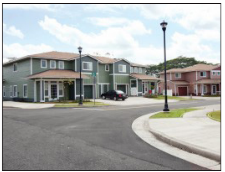
U.S. Army Garrison - Hawaii housing communities like Helemano Military Reservation, a housing area for Schofield Barracks, continue to expand the renewable energy program with the installation of photovoltaic systems atop existing homes through builder Island Palm Communities.

"Since we started our development in 2004, there's been tremendous growth in methods, technologies and business models surrounding energy