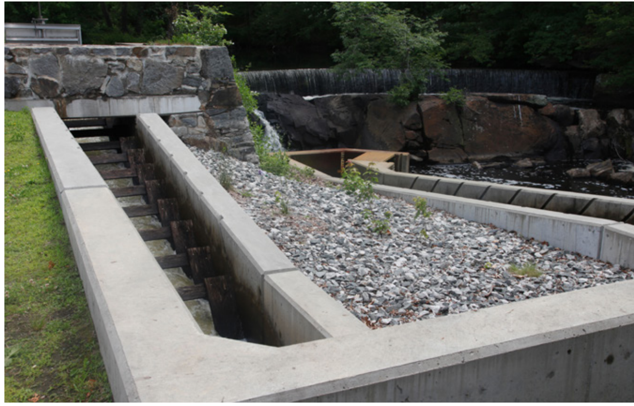
One of the fish ladders constructed along the Ten Mile River. The Denil Fishways provide for upstream migration of anadromous fish to their historic spawning areas

"Each fishway is composed of 4-footwide channels that have a one vertical on eight horizontal floor slope to allow the passage of river herring, such as blueback herring and American Shad," Barron said.