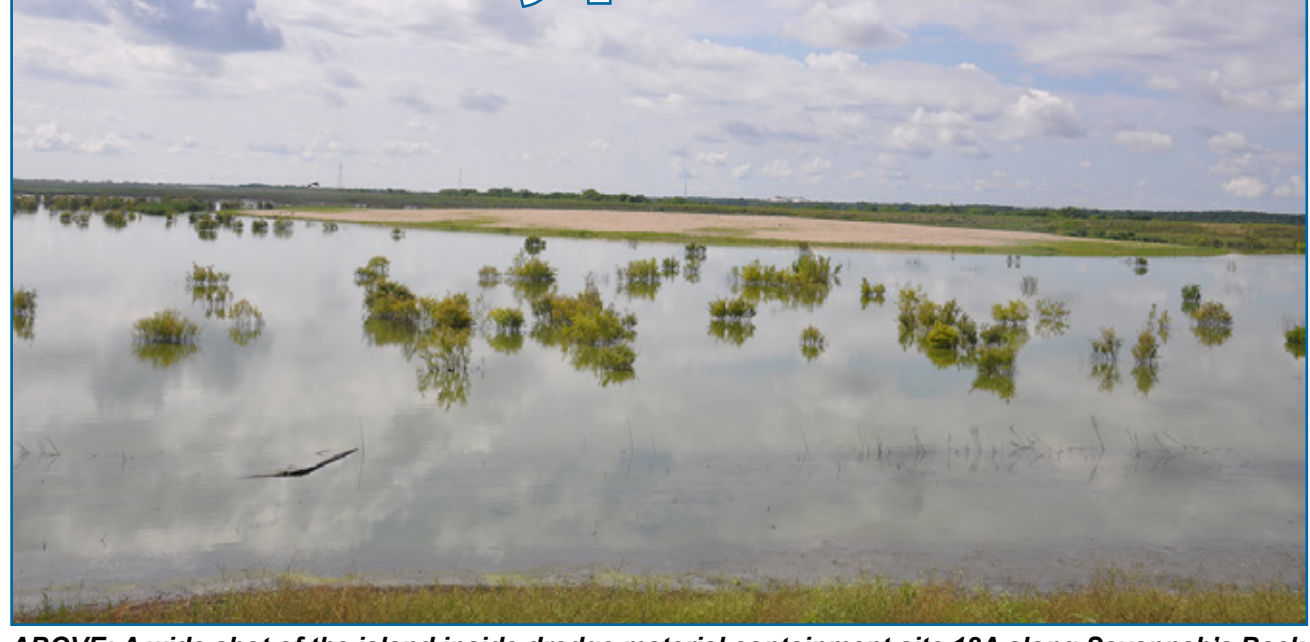
ABOVE: A wide shot of the island inside dredge material containment site 12A along Savannah's Back River. The manmade island boasts the largest colony of least terns in South Carolina, which are listed as threatened, and also provides nesting areas for black skimmers and gull-billed terns, which are listed as a species of concern, a classification just below threatened, in South Carolina. BELOW: Birds face into the wind at Tybee Island.

Males exhibit this behavior to attract mates and show they can bring home the