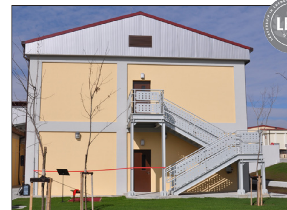
The recently completed Ankara Administrative Facility, a $1.3 million, 15,700-square-foot building, houses the legal, traffic management and post offices serving Incirlik Air Base personnel and their family members. The building officially opened March 26 and is the first LEED-certified U.S. government facility in Turkey.

Upon certification. the project earned 53 of 59 possible LEED-Silver points. Some of the sustainable features include installation of materials with high recycledcontent value and extra-thick building insulation; application of indoor air-quality management, and erosion and sediment