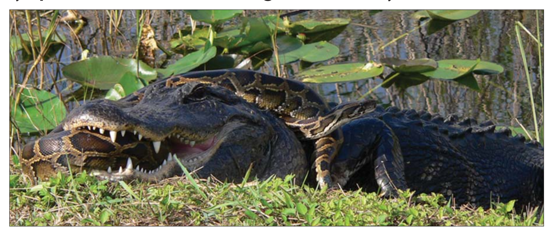
An American alligator struggles with a Burmese python. The phythons compete directly with the top predators in the Everglades ecosystem.

Known for their docility, Burmese pythons were sold as exotic pets. The release of unwanted pets led to an introduction of the exotic species in south Florida, mostly in Everglades National Park. In the last 12