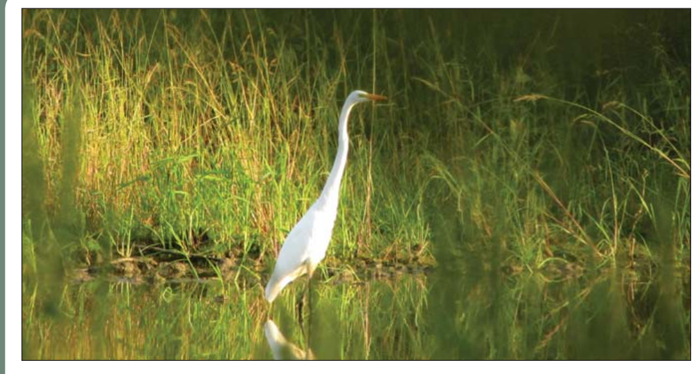
Great White Egret (Ardea alba) foraging for food in a wetland at Wendell H. Ford Regional Training Center in Kentucky.