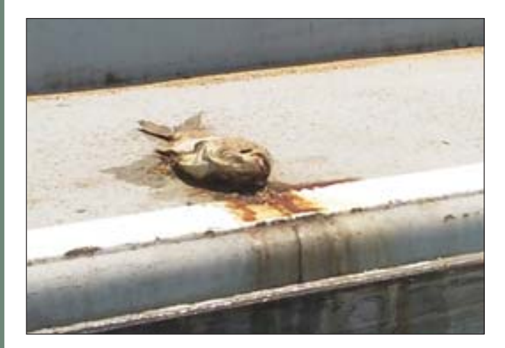
DNA seeps into water from a dead silver carp on a barge.