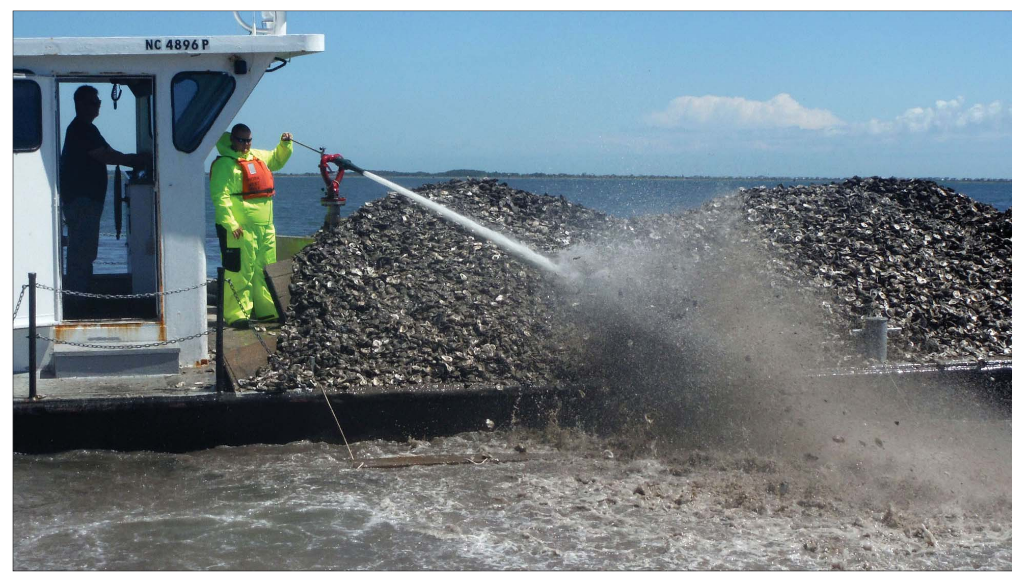
Workers scatter oyster shells into the water May 14. The area was primed for future oyster reef habitat during the last several years.