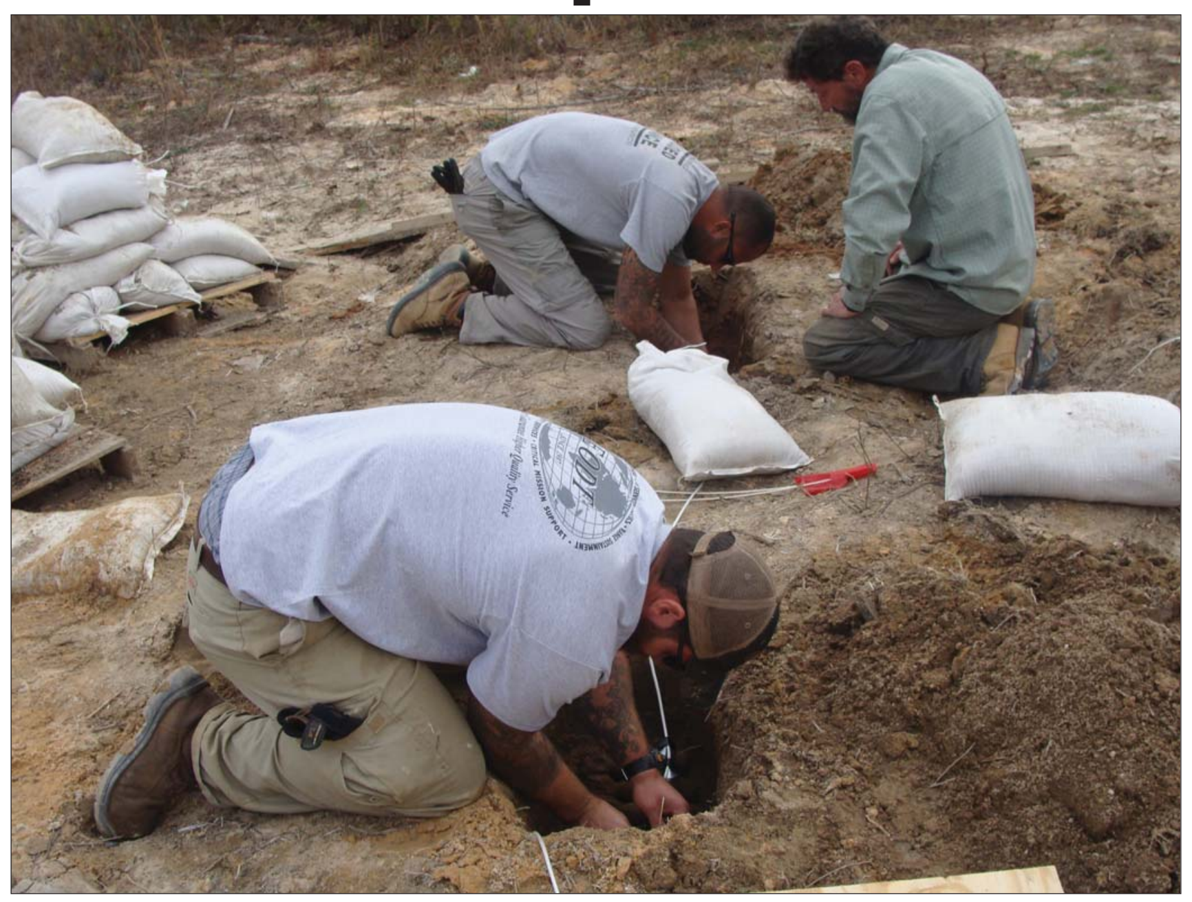
Workers install wiring to detonate unexploded munitions discovered at the power corridor site on former Camp Wheeler.

While the removal portion of the work is complete, the team still needs to complete a removal action report and conduct a public meeting to reveal the findings. The overall