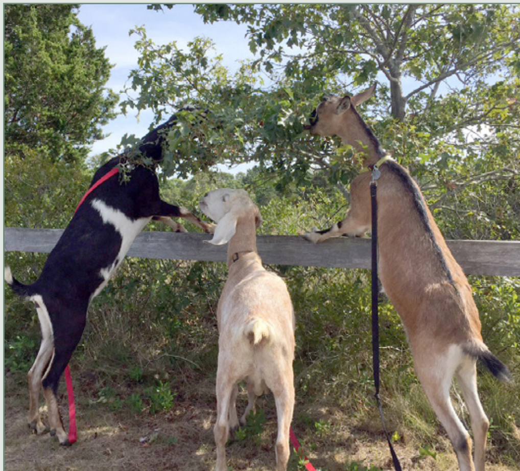
Goats munch on vegetation, including invasive and nuisance plants like poison ivy, along the banks of the Cape Cod Canal in September. (Courtesy photo)

The goats had not escaped from a local farm — they were invited guests hired by canal staff to eat all the invasive plants they could for about a week. The goats' handler set up a perimeter fence to meet the grazing requirements and delivered the goats.