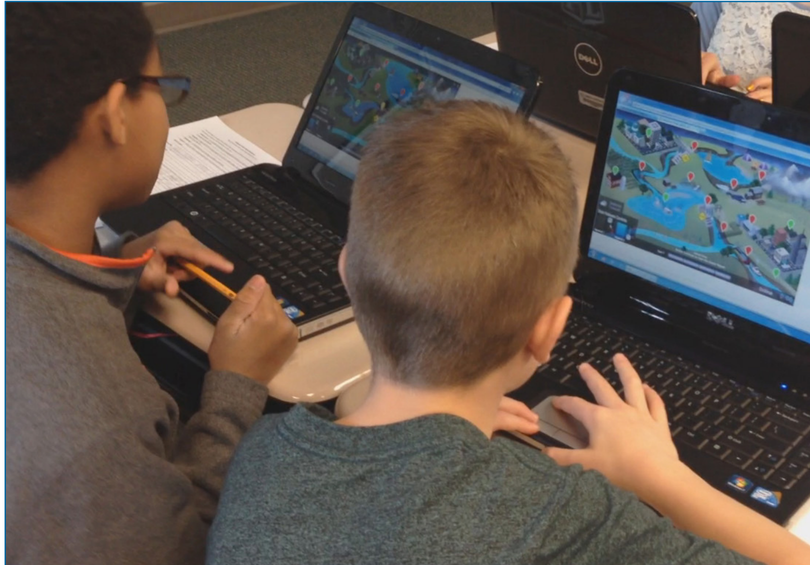
Students, who beta tested the River Basin Balancer Game in early 2015, reported that sometimes it's not fair because the game doesn't let you control the weather, and you can't get water when there isn't any rain.

"The hardest ones to keep green are ones where water is needed," said one student game tester. "If it's too high, you can let water out. But you can't control the weather or make more water."