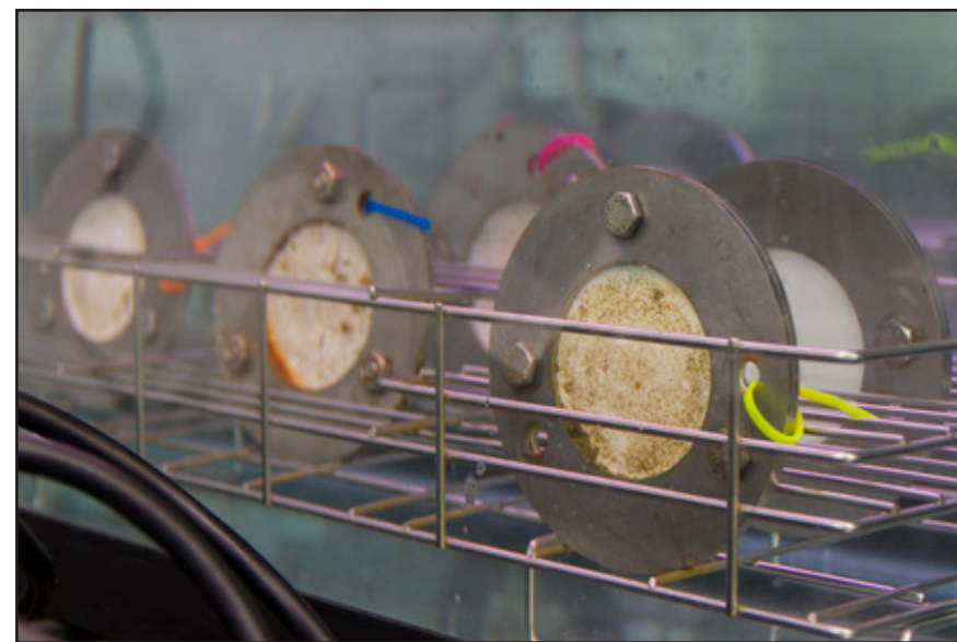
ERDC-EL Research Biologists Dr. Guilherme Lotufo and Lauren Rabalais set up a replicate aquaria experiment in an Environmental Risk Assessment Branch laboratory. They are investigating how increasing degrees of biofouling impacts the uptake rate of munitions constituents using polar organic chemical integrative samplers (POCIS) in coastal environments. Left is a close-up showing POCIS with increasing degrees of biofouling.

in nature and sporadic water sampling is unlikely to accurately characterize water concentrations over time.