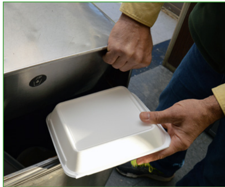
The Natick Soldier Systems Center in Massachusetts is turning to compostable dinnerware and eliminating plastic foam containers like this one from the waste stream.

"That's important that people know where to put stuff," Valcourt said, "because