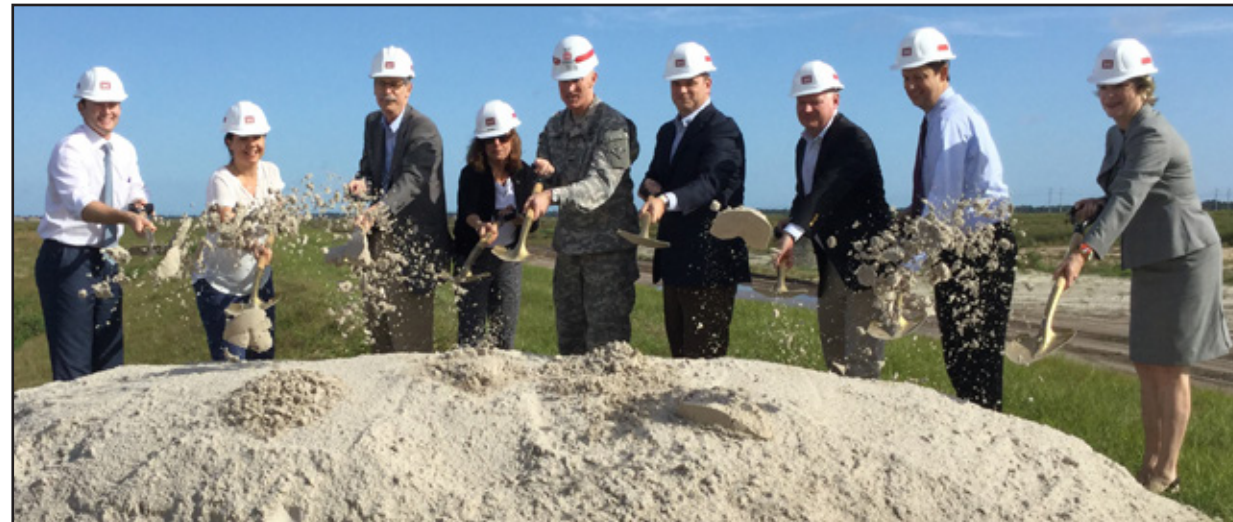
Federal, state and local officials celebrated the start of a major construction contract for the reservoir component of the C-44 Reservoir and Stormwater Treatment Area project Nov. 20, a critical restoration project to restore America's Everglades.