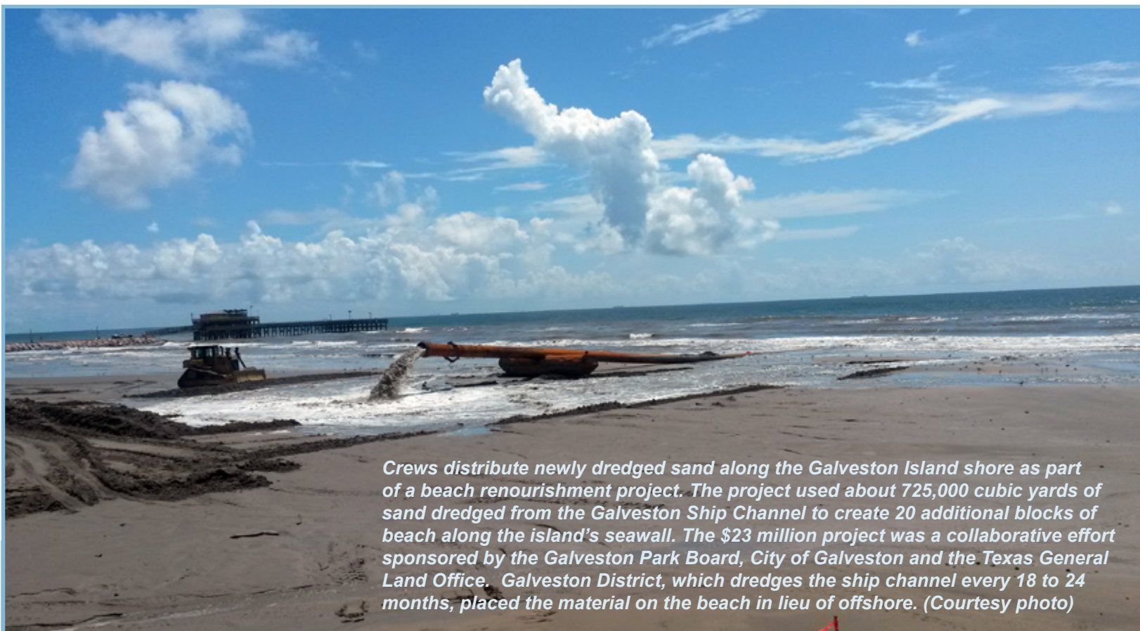
Crews distribute newly dredged sand along the Galveston Island shore as part of a beach renourishment project. The project used about 725,000 cubic yards of sand dredged from the Galveston Ship Channel to create 20 additional blocks of beach along the island's seawall. The $23 million project was a collaborative effort sponsored by the Galveston Park Board, City of Galveston and the Texas General Land Office. Galveston District, which dredges the ship channel every 18 to 24 months, placed the material on the beach in lieu of offshore.