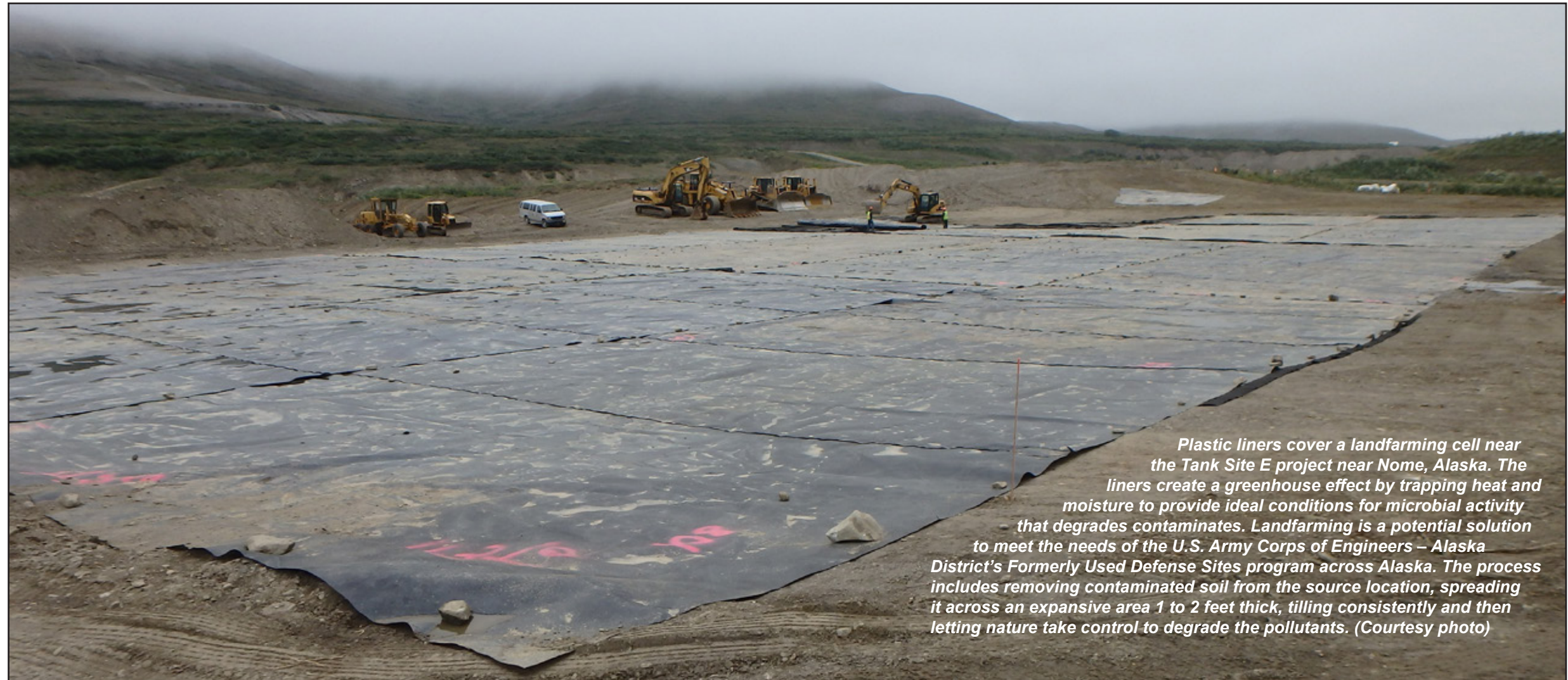
Plastic liners cover a landfarming cell near the Tank Site E project near Nome, Alaska. The liners create a greenhouse effect by trapping heat and moisture to provide ideal conditions for microbial activity that degrades contaminants. Landfarming is a potential solution to meet the needs of the U.S. Army Corps of Engineers – Alaska District's Formerly Used Defense Sites program across Alaska. The process includes removing contaminated soil from the source location, spreading it across an expansive area 1 to 2 feet thick, tilling consistently and then letting nature take control to degrade the pollutants.

Tank Site E is one example of a project that presents