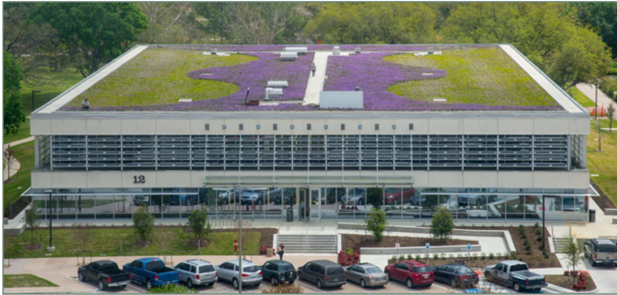
Building 12 was the first to be built on Johnson Space Center's historic central mall in 1962, and the first to be renovated, in 2013. It was stripped to its steel frame and rebuilt to Gold Certification Leadership in Energy and Environmental Design (LEED). Outdated building systems were replaced with energy-efficient equipment. It became the first building at JSC to have a vegetative roof, which eliminates the heat-island effect, reduces stormwater runoff and increase the building's energy efficiency.

distribution strategies such as cogeneration, solar, wind and storage.