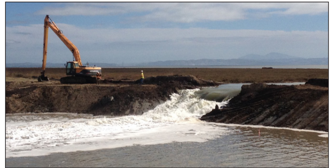
A levee at Sears Point in Sonoma County, California, is breached as part of a project to restore wetlands and protect the San Francisco Bay area against anticipated sea level rise. The largest private environmental project in the Bay Area was authorized by the U.S. Army Corps of Engineers' San Francisco District under terms of the Clean Water Act.

Additional information on the C-44 Reservoir and STA is available online at http://bit.ly/C-44_CERP .