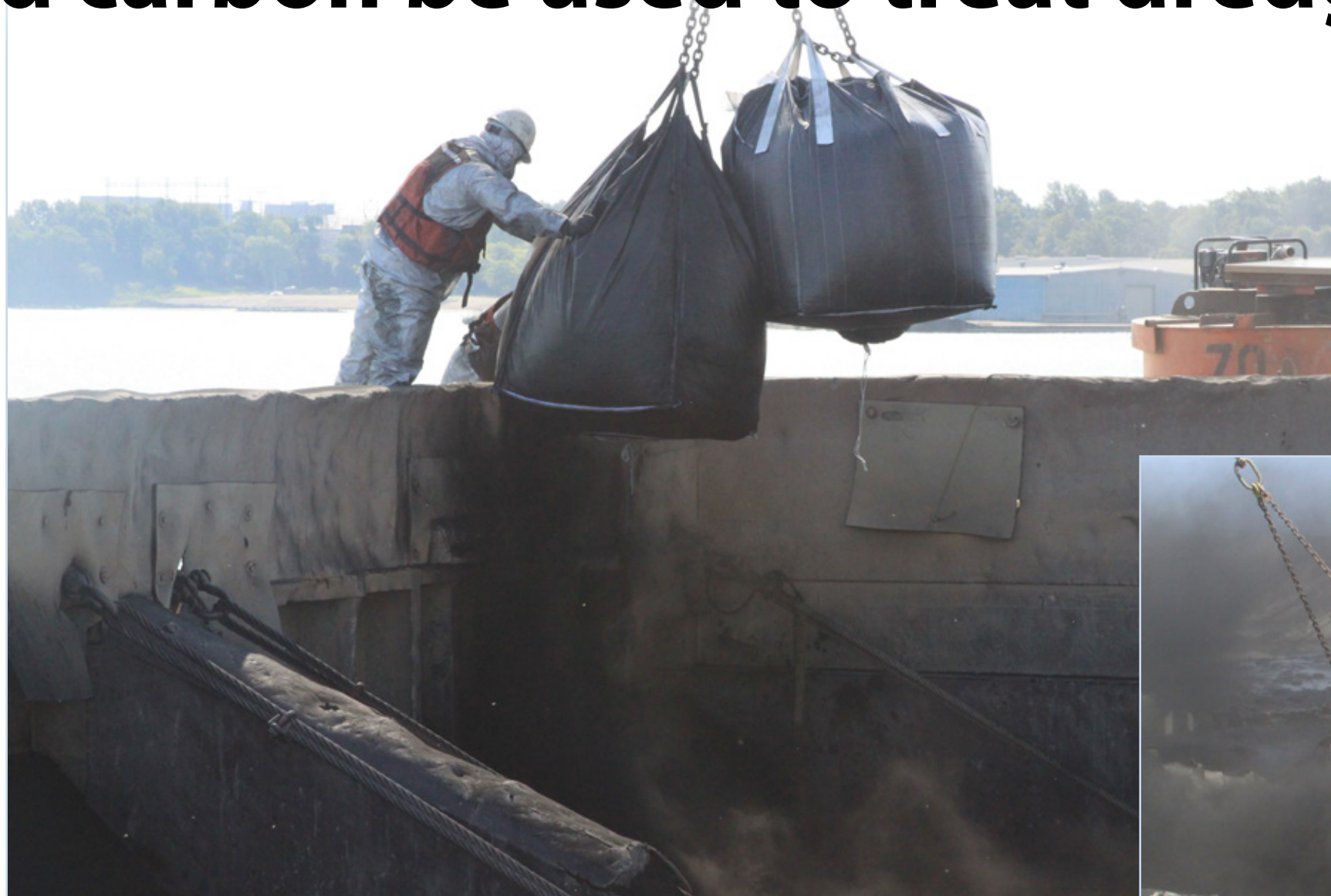
Super sacks of powdered and granular activated carbon are added to a scow of dredged sediment before mixing with a clamshell bucket. A clamshell is used to thoroughly mix activated carbon and dredged sediments in a scow, before it is placed in the open lake.

"Activated carbon has been used as a purification agent by many industries to treat water, air and alcohol to name a few," said Paul Schroeder, ERDC sediment management team leader. "It is considered 'activated' when it goes through a process in which the carbon is made more porous, increasing its surface area, and preparing it to accept contaminants."