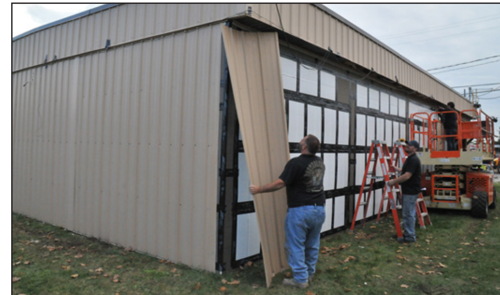
A crew from the Fort Drum Public Works' Carpentry and Electrical Shop cover the high-performance insulation panels with sheet metal siding on the exterior of a building in the 400 area.