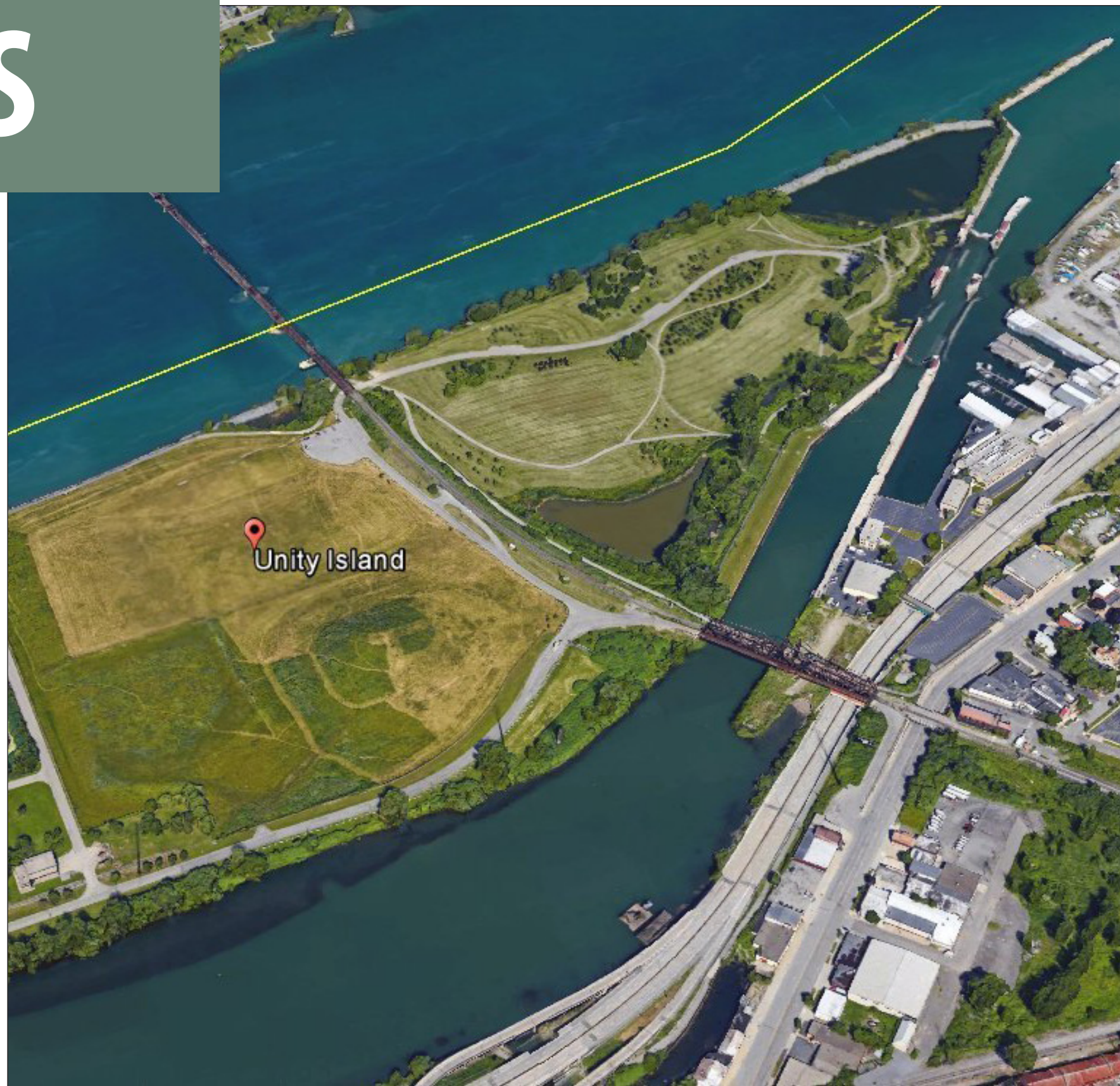
The U.S. Army Corps of Engineers Buffalo District awarded a $1.39 million contract in September to Tidewater Inc. of Elkridge, Maryland, in support of the Unity Island Aquatic and Riparian Invasive Species Management and Habitat Restoration Project for the removal of aquatic invasive species (AIS) from Unity Island in Buffalo, New York. As part of the Great Lakes Restoration Initiative, the demonstration project will be conducted in coordination with the city of Buffalo and the Engineer Research and Development Center. Methods used to control AIS will be monitored for a period of three years before potentially being employed throughout the Great Lakes in coastal wetland environments similar to Unity Island. The project includes implementing AIS control and management, introducing container-grown woody, shrub and herbaceous native plant species, planting in-water submerged aquatic vegetation (SAV), installing in-water fish attraction structures, planting in-channel SAV and installing fish attraction structures, and expanding riparian and wetland buffers. The goal of this demonstration is to evaluate the efficacy of a number of invasive species removal methodologies.