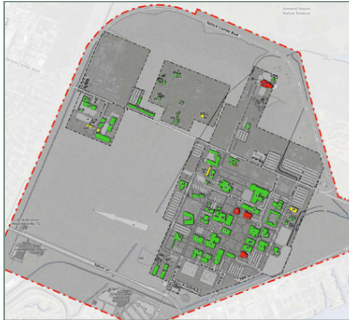
Most JSC structures today consume more than 20 kilowatt-hours per square foot per year. This energy use intensity map shows that by adopting Best Case recommendations, most buildings consume less than 16 kilowatt-hours a year after 20 years (shown in green).