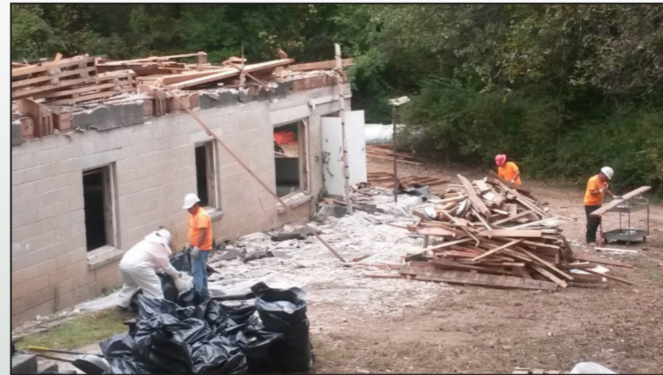
LEFT: Bhate employees work to deconstruct a chapel — one of three World War II era buildings selected for the deconstruction pilot program — on Fort Leonard Wood, Missouri. BELOW: Deconstruction of the chapel began Sept. 16, with major deconstruction completed by Oct. 7. Once the building was removed, the contractors backfilled and seeded the lot. Overall, 252 tons, almost 85 percent of the material collected from the chapel was recycled or reused.

Because there was a market for the lumber, deconstruction became even more feasible and work on