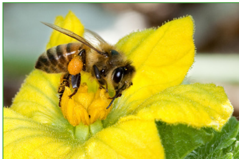
A honey bee, with pollen attached to its hind leg, pollinating a watermelon flower.

One specific pollinator species that is gaining attention is the Monarch Butterfly, which the Corps of Engineers is well positioned to assist in the recovery of this iconic species. The U.S. Fish and Wildlife Service, state agencies and experts in the field have identified the Interstate 35 corridor, which extends from the Texas-Mexico border to Duluth, Minnesota, as a key pathway for Monarch migrations. Within 50 miles of this corridor, the Corps of Engineers manages 45 water resources projects and more than 1 million acres. On the southern end of the corridor the Fort Worth District personnel