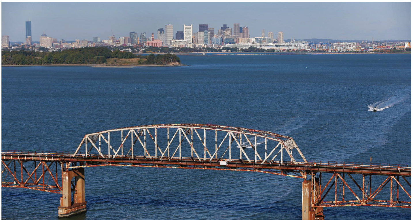
Long Island Bridge located in Boston Harbor in Quincy and Boston, Massachusetts.

Public comments were accepted through May 4.