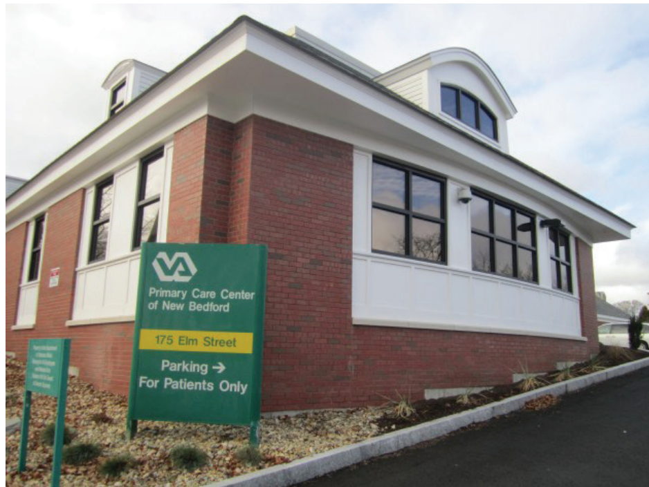
New Bedford Community-Based Outpatient Clinic in New Bedford, Massachusetts.

Estate Team administered leases for approximately 250 military single and multi-service recruiting stations throughout the District and in turn