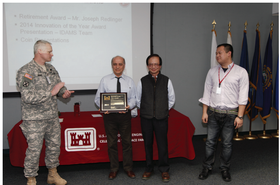
Members of the iDams team accept the 2014 Innovation of the Year Award.