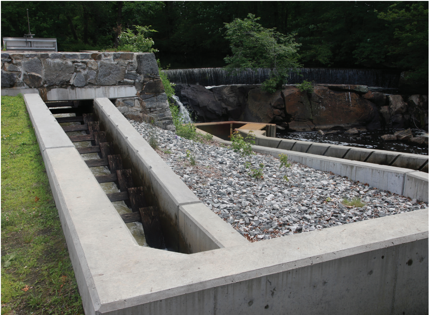
One of the fish ladders that was constructed along the Ten Mile River.