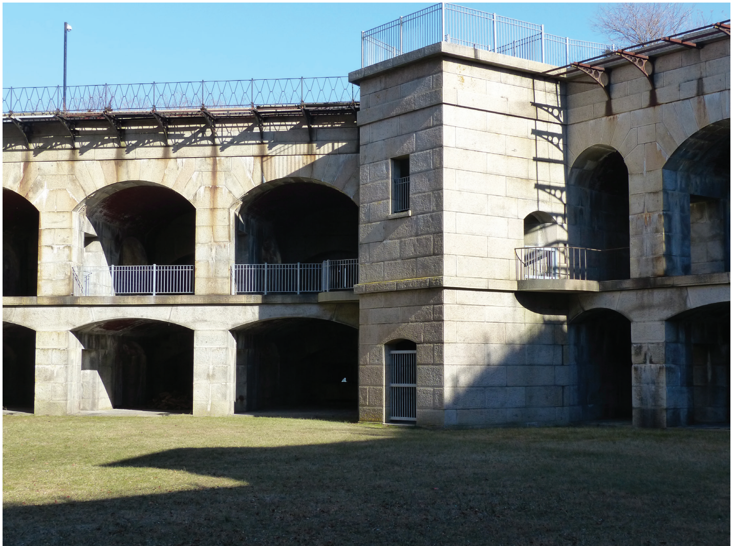
The New England District and Tantara Associated Corporation installed fall protection barricade railings all over Fort Rodman.

Repair work to the Bearskin Neck Stone Jetty in Rockport, Massachusetts is complete. Despite being hit with a harsh winter that included Winter Storm Juno, field work was completed on the Bearskin Neck Jetty repairs two days before Memorial Day weekend. The work on the $3.3 million project consisted of repairing the 540-foot-long jetty that was damaged during Hurricane Sandy. The Bearskin Neck Jetty is located at the northern end of Bearskin