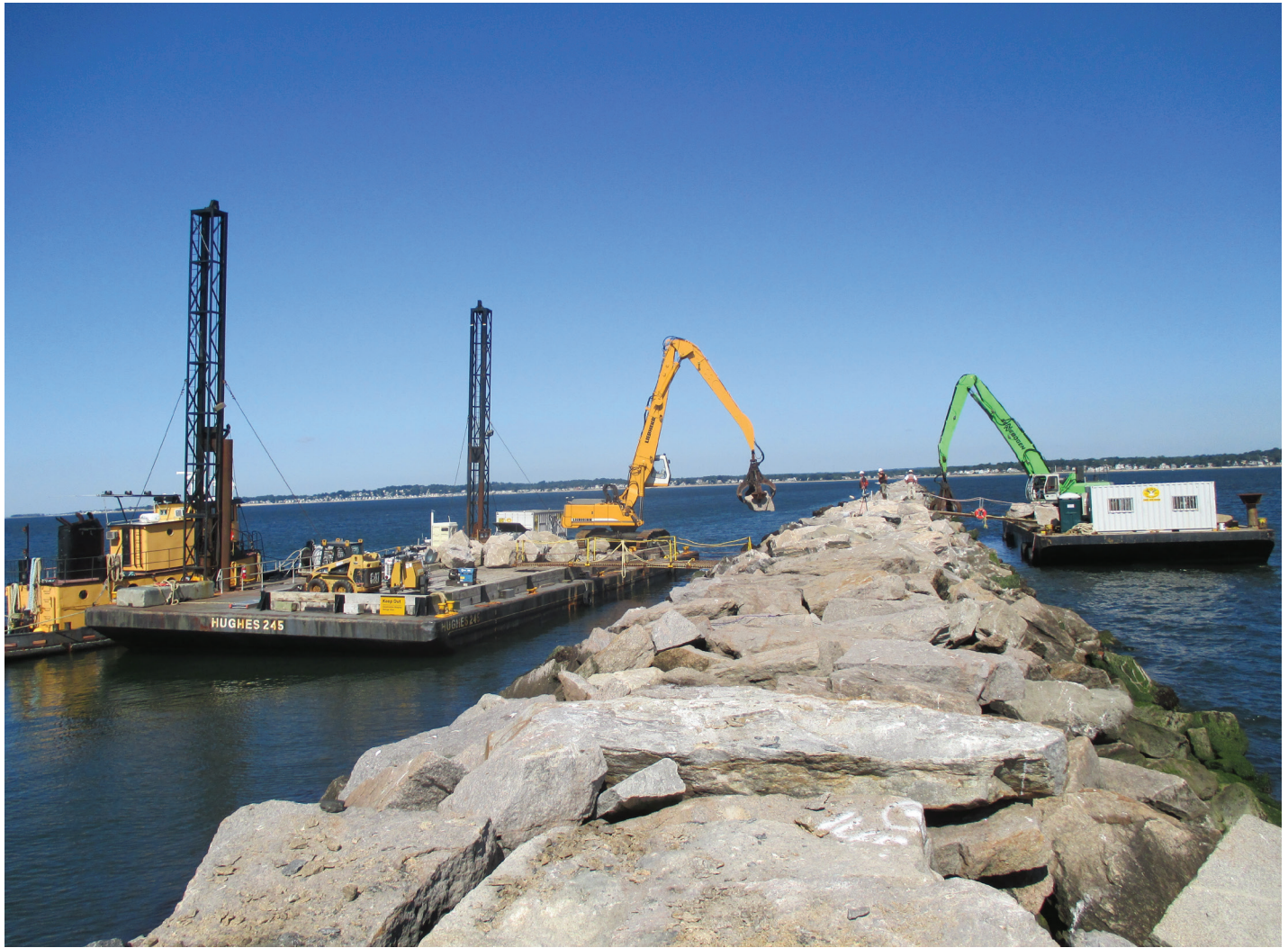
District contractor Mohawk Northeast performs breakwater repairs at New Haven Harbor.