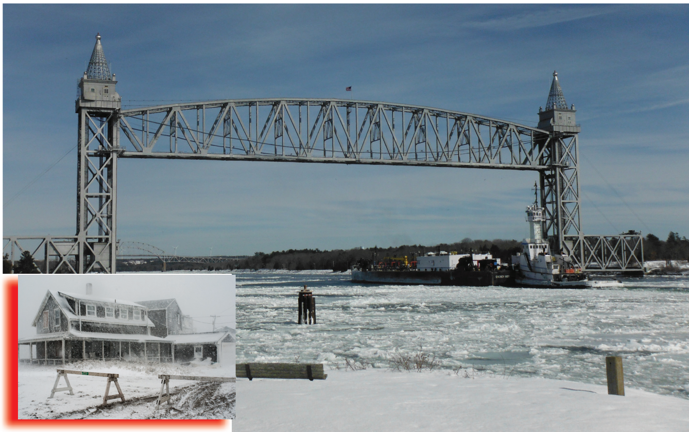
Coastal communities had to cope with strong winds, flooding and snow during winter storm Juno while ice crowds the Cape Cod Canal.