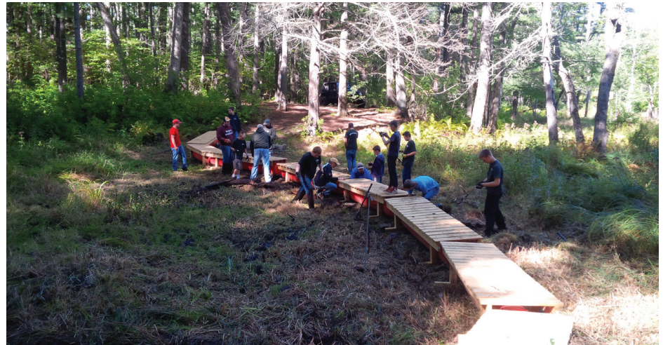
National Public Lands Day 2015

West Hill Dam , partnering with the Friends of Beginning Bridges of Northbridge and Uxbridge, hosted such an event at the recreational site's beach area Aug. 12. Nearly 90 people from very small children to bigger kids 12 and over participated in the event. There were no age limitations to make a sand castle. The rules were very simple – bring your own tools and creativity. No live decorations and no spray paint for