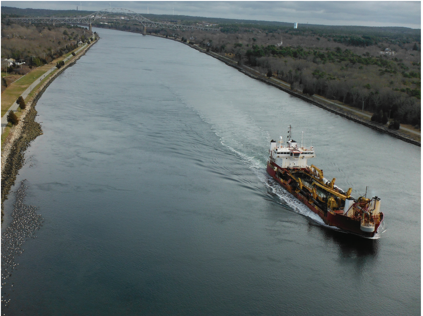
Contractor's dredge arrives at the Cape Cod Canal to begin dredging project.