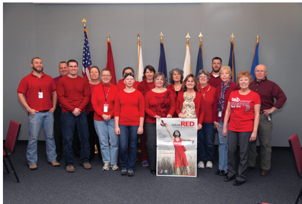
New England District Team Members dress in red to bring awareness to heart disease.

The New England District team celebrated the season with a holiday celebration lunch on Dec. 18 in the Concord Park Cafeteria. Over 160 people attended the party. This year's theme was, "Rudolph the Red-Nosed Reindeer and the Land of Misfit Toys."