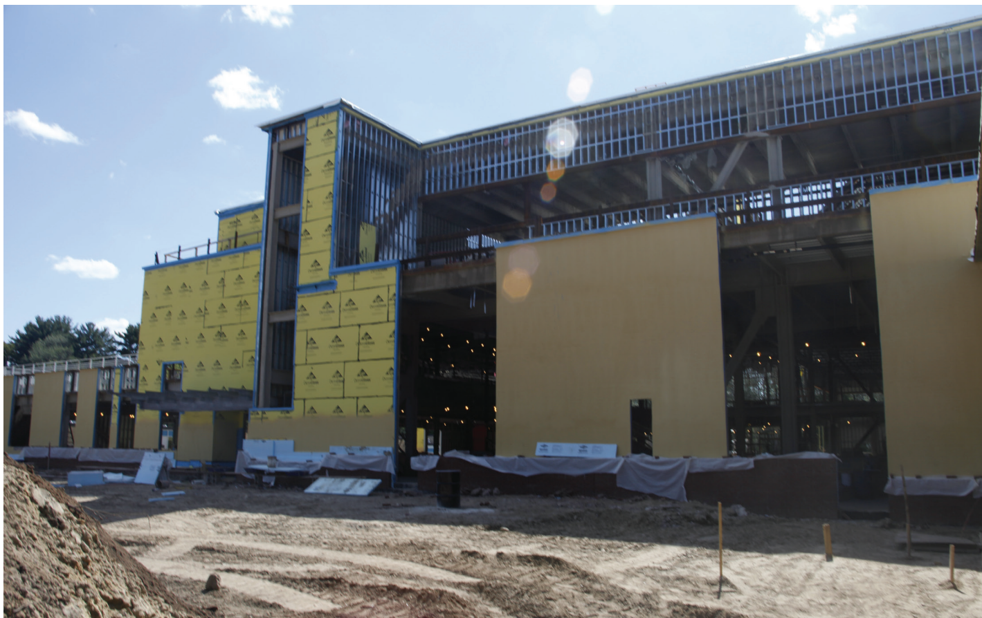
Hanscom Middle School construction on Hanscom Air Force Base, Massachusetts.