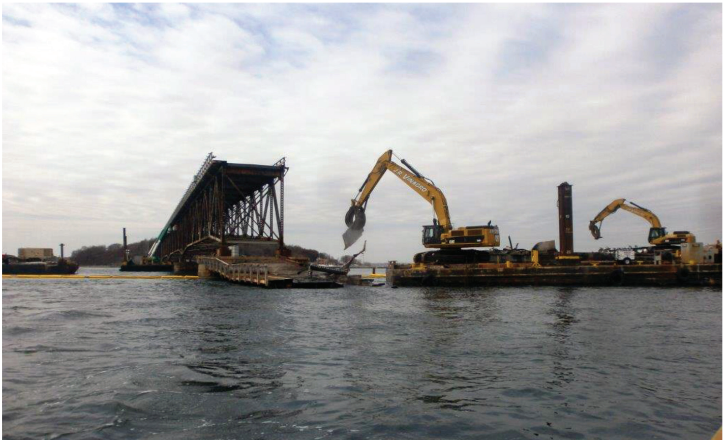
Contractor Walsh Construction removes and sorts bridge debris with barges and excavators.

In 2015 the New England District planned, designed and executed programs and projects to remediate hazardous, toxic, military munitions, and radiological waste sites in support of Military, Civil, Interagency, International and Environmental Integration customers executing Superfund (EPA), Formerly Used Defense Sites (FUDS), Installation