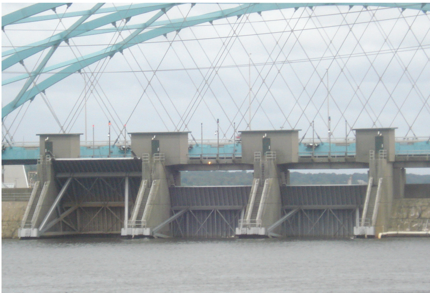
Fox Point Hurricane Barrier in Providence, Rhode Island.

The New England District has completed a draft Environmental Assessment (EA) and draft Finding of No Significant Impact for the continued operations and maintenance activities