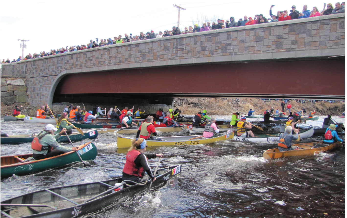
Birch Hill Dam and Tully Lake Dam provide water releases to paddlers along Millers River.

It was fitting that it rained at Northfield Brook in Thomaston, Connecticut, during the flood damage reduction project's 50 th anniversary