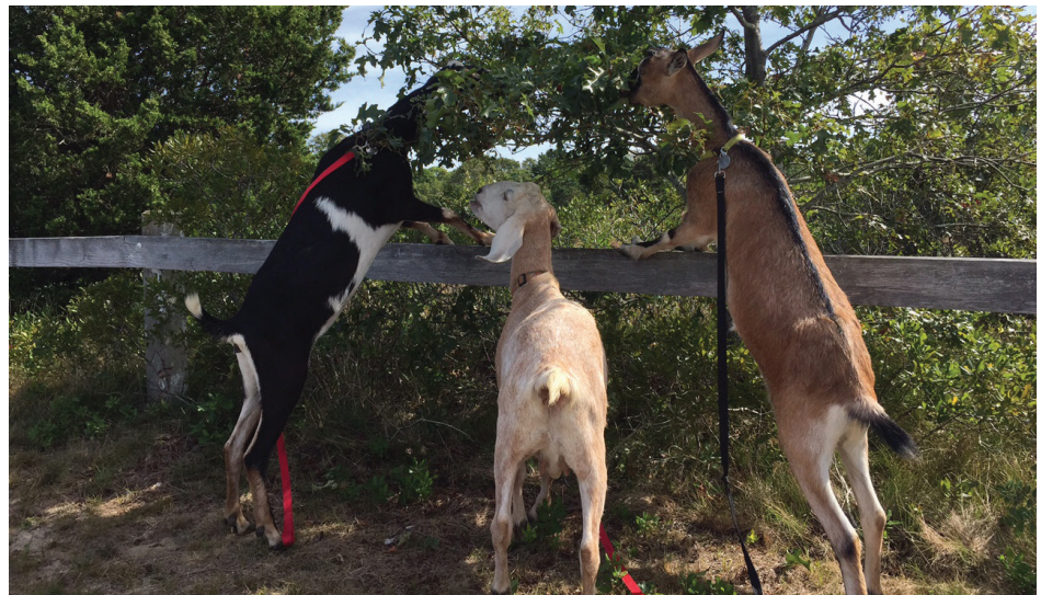
Goats munch on vegetation along the banks of the Cape Cod Canal.

Butterflies," by Melissa Steward were posted for the families to read during the walk. The panels were beautifully illustrated and were original prints from the book. Worcester Senior Center volunteers sealed the panels with a high gloss, moisture resistant varnish and mounted on storyboards that attached to the post they provided.