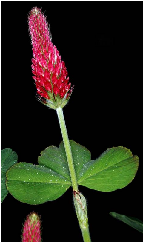
© G.D. Carr, 2006, courtesy of Burke Museum of Natural History, University of Washington

Contributed by: USDA NRCS Corvallis Plant Materials Center, Oregon