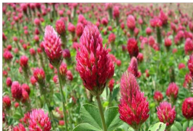
Seed increase field of crimson clover at the USDA-NRCS Jimmy Carter Plant Materials Center, Americus, GA.

In the Willamette Valley of Oregon, where much of the US crimson clover seed is produced, fields are planted in late September with the fall rains, flower in mid-May, and are harvested in late June to early July when about three-fourths of the pods have turned golden brown (Aldrich-Markham, 2012). Plants are swathed at night, when they are damp with dew, to reduce losses of the easily shattered seed. Seed is allowed to dry in the swath for about a week, and then harvested with a combine using a belt pick-up header. Honeybee colonies placed in or near blooming fields will generally increase seed set and harvestable yields. Seed set may range from 1,000 to 1,200 lb/acre, but harvested yields are generally around 750 lb/acre due to shatter before and during harvest (Chastain, 2012; Hollowell, 1951). In Georgia, yields of improved cultivars such as 'AU Sunrise' and 'AU Sunup' harvested by direct combine are typically between 100 and 200 pounds of clean seed per acre.