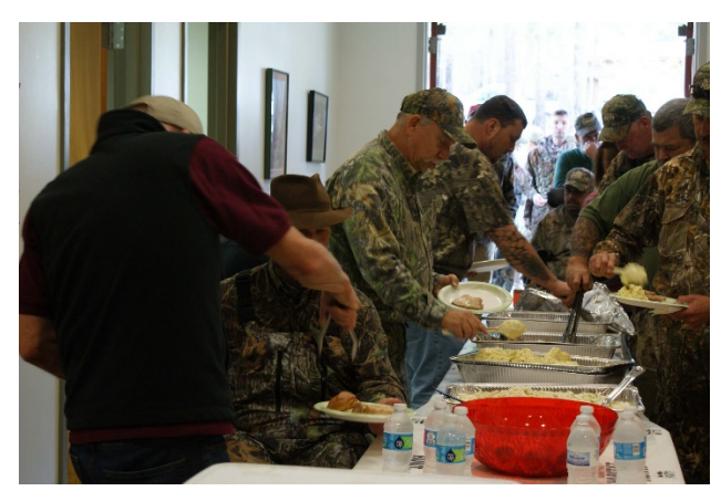
Aiken Sertoma Club serving food at the 2016 Savannah River Site's Ultimate Turkey Hunt