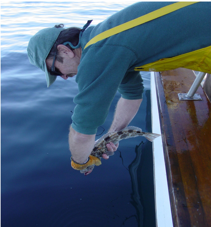
Releasing an undersized Lingcod