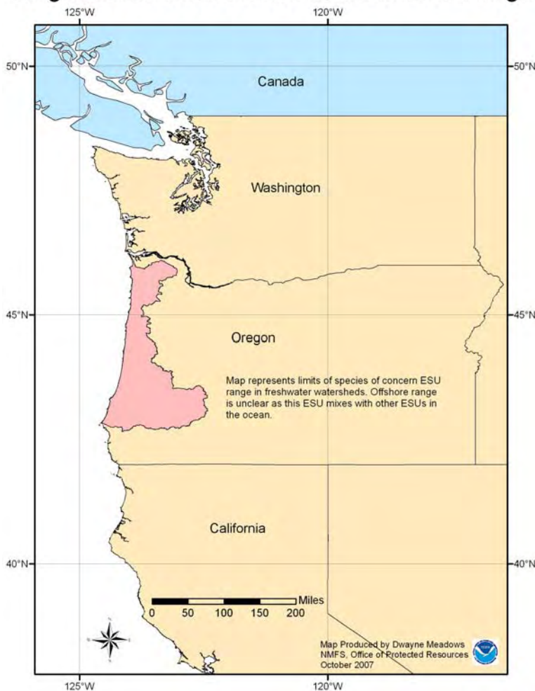
Figure 1. All watersheds which contain the Oregon Coast steelhead trout ESU. Ocean range is unclear as this ESU mixes with other steelhead populations.